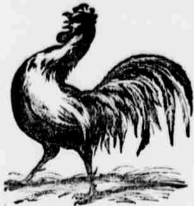
THIS IS A ROOSTER!