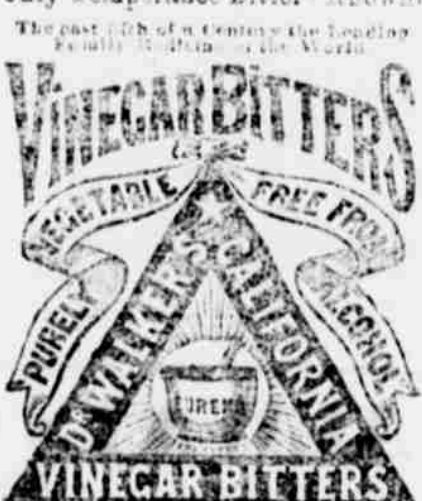
R. H. McDonald Drug Co., Proprietors, SAN FRANCISCO AND NEW YORK.

Vinegar Bitters, Quineptus, Royal Elixir, and Royal Pills.