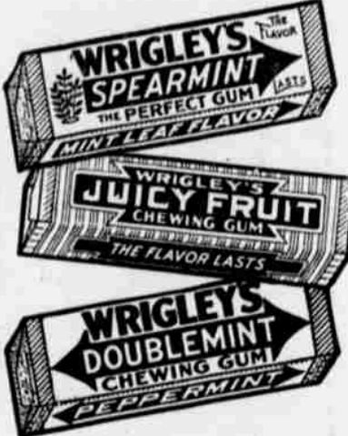
SEALED TIGHT—KEPT RIGHT

in the pink sealed wrapper and take your choice of flavor. Three kinds to suit all tastes.