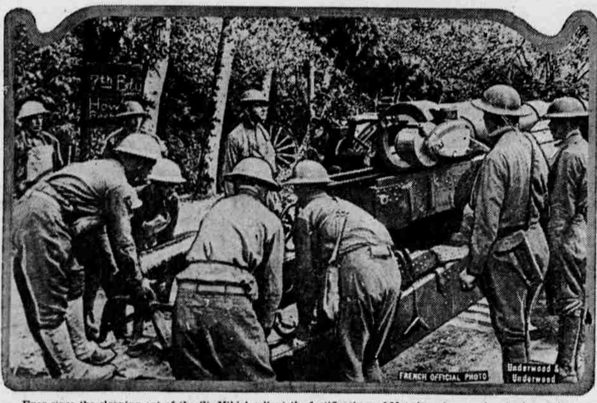
Ever since the cleaning out of the St. Mihlel salient the fortifications of Metz have been under the fire of the Amer-