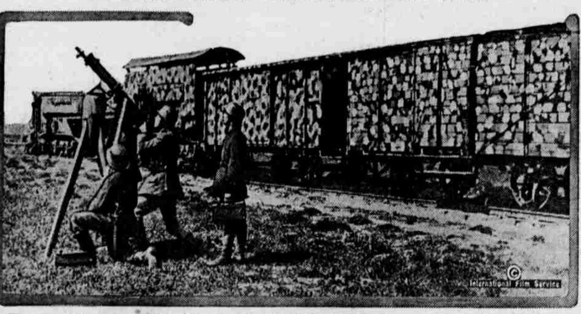
This photograph shows a German artillery train camouflaged for protection against bombs from French, Eng-