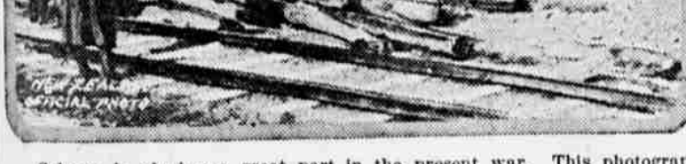
Salvage is playing a great part in the present war. This photograph shows timber salvaged from German dugouts...