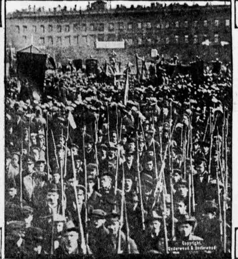
The first photograph to arrive in this country of members of the bolshevik "Red Guard," about which much has been heard during the overturning of the provisional government.