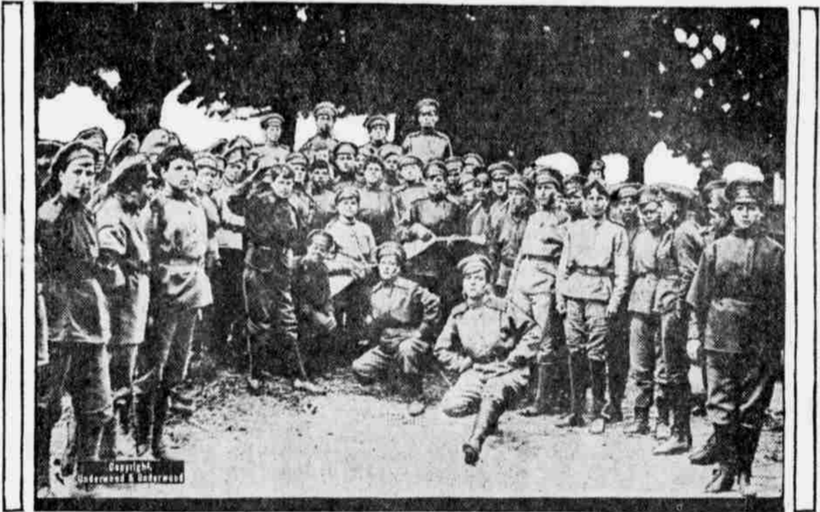
Fighting is new to the Russian women, and the tension for them is much greater than for the men. To relax from their warlike vigilance, they hold dances and play games in their camp. This unusual photograph shows a few of the women entertaining the other members of the regiment. They all belong to the Battalion of Death.