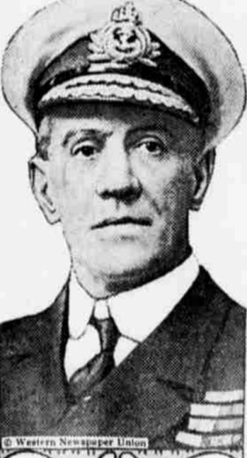
Admiral Cecil Burney of the British navy who is in command of the fleet patrolling the coast of Scotland.