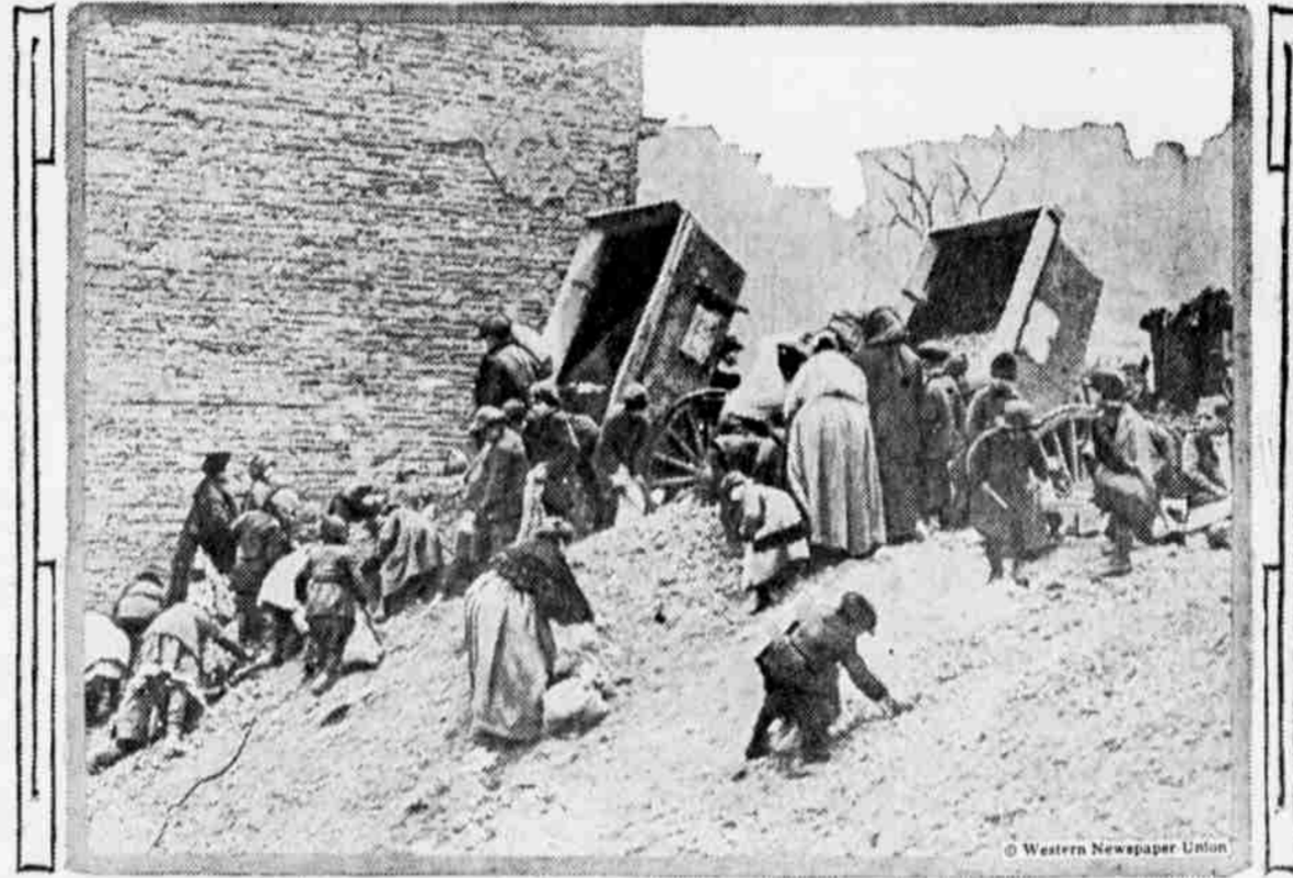
Some idea of the scarcity of fuel in the East is gained from this photograph, showing poor people of the East Side of New York digging for coal in the city ash heaps on the site of the $12,000,000 courthouse that is to be erected.