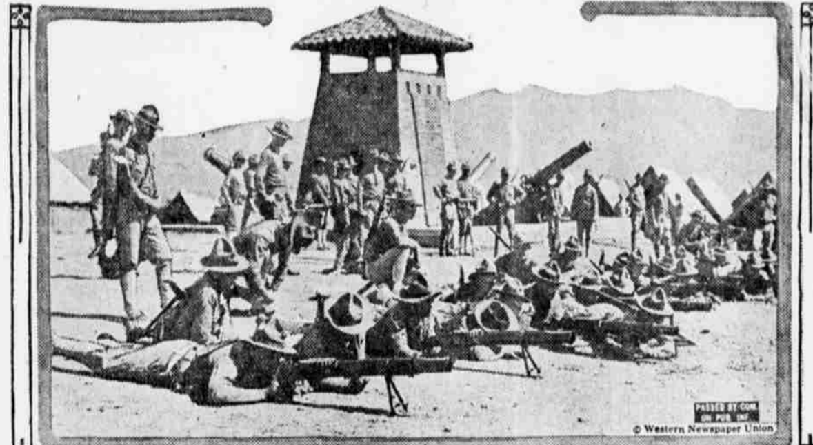
A division of United States marines is being given intensive training in a camp near the battlefield of San Juan, Cuba, and finds the conditions ideal. The photograph shows a Lewis machine gun battery practicing at the San Juan blockhouse.