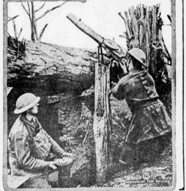
These Australian machine gunners are in a hole formed by a shell-shattered tree. They are having a pot-shot at a Boche airplane.