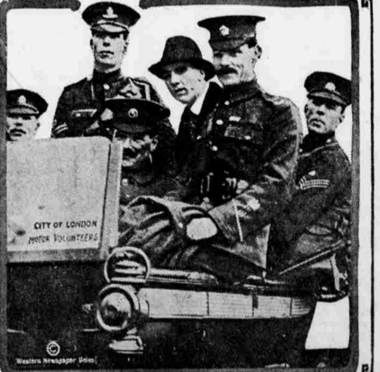
Officers of the first seven divisions of the British army that entered the war in France, called by themselves the "Old Contemptibles," were given a great reception in London when they returned from prison camps in Germany.