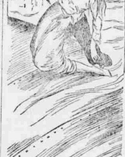
Donald Grasped Ida in His Arms and Clambered on Deck.

Lansdowne, Pa., new St. Vincent's home for orphans cost $3,000,000 or more.