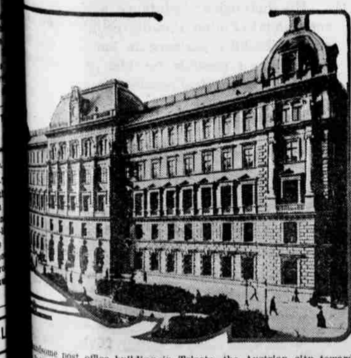
Impending post office building in Trieste, the Austrian city toward which Italian armies are slowly forcing their way.