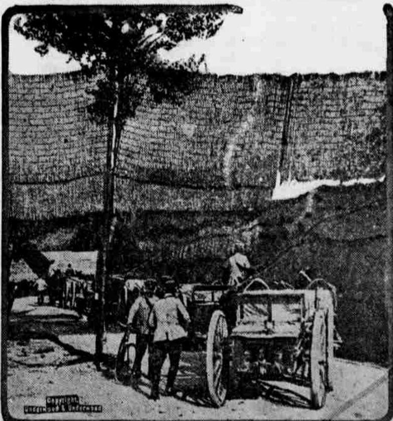
Where the Italians are driving back the Austrians high in the mountains on the Isonzo front camouflage is practiced extensively by the Italians to protect their lines of communication and supplies. This photograph shows the road to Vipulzano protected by a screen of straw from the artillery fire of the enemy that is constantly sweeping over it. A supply train is passing along the road.