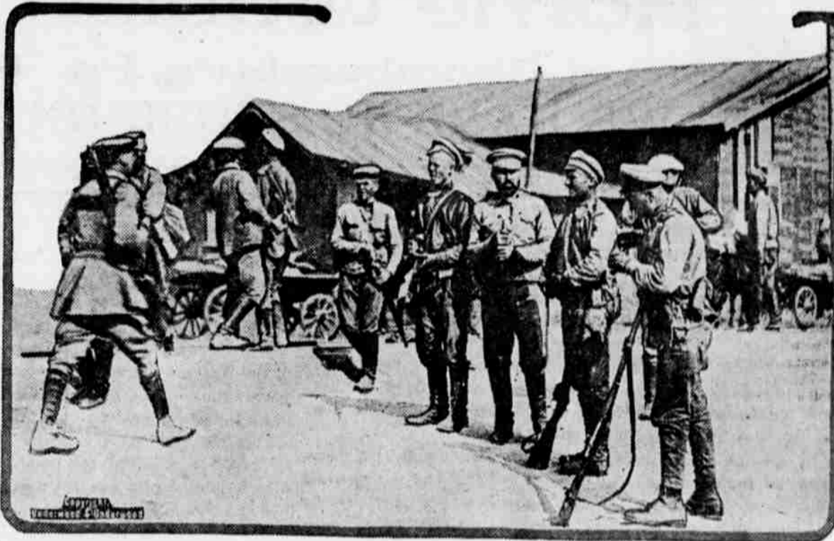
When the Russians were fleeing before the Germans guards were drawn up at many points across the line of retreat to maintain some semblance of order and prevent panics. This is the first photograph of that incident of the Russian retreat to arrive in this country.