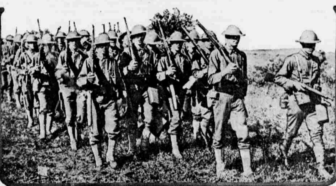
American troops wearing their new steel trench helmets at a training camp near the French front.