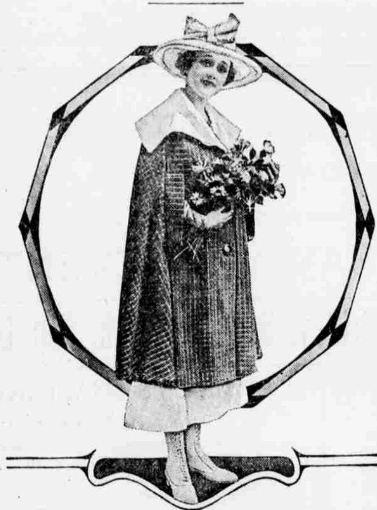
Style and Character in Capes.

New models in tailored suits are definitely relegated to the past as the rarely without decoration of some sort. long skirt for street wear. That is Broad fur, fur fabrics, velvet and butn folly to which women are not likely tons are all used on them, but with much moderation.