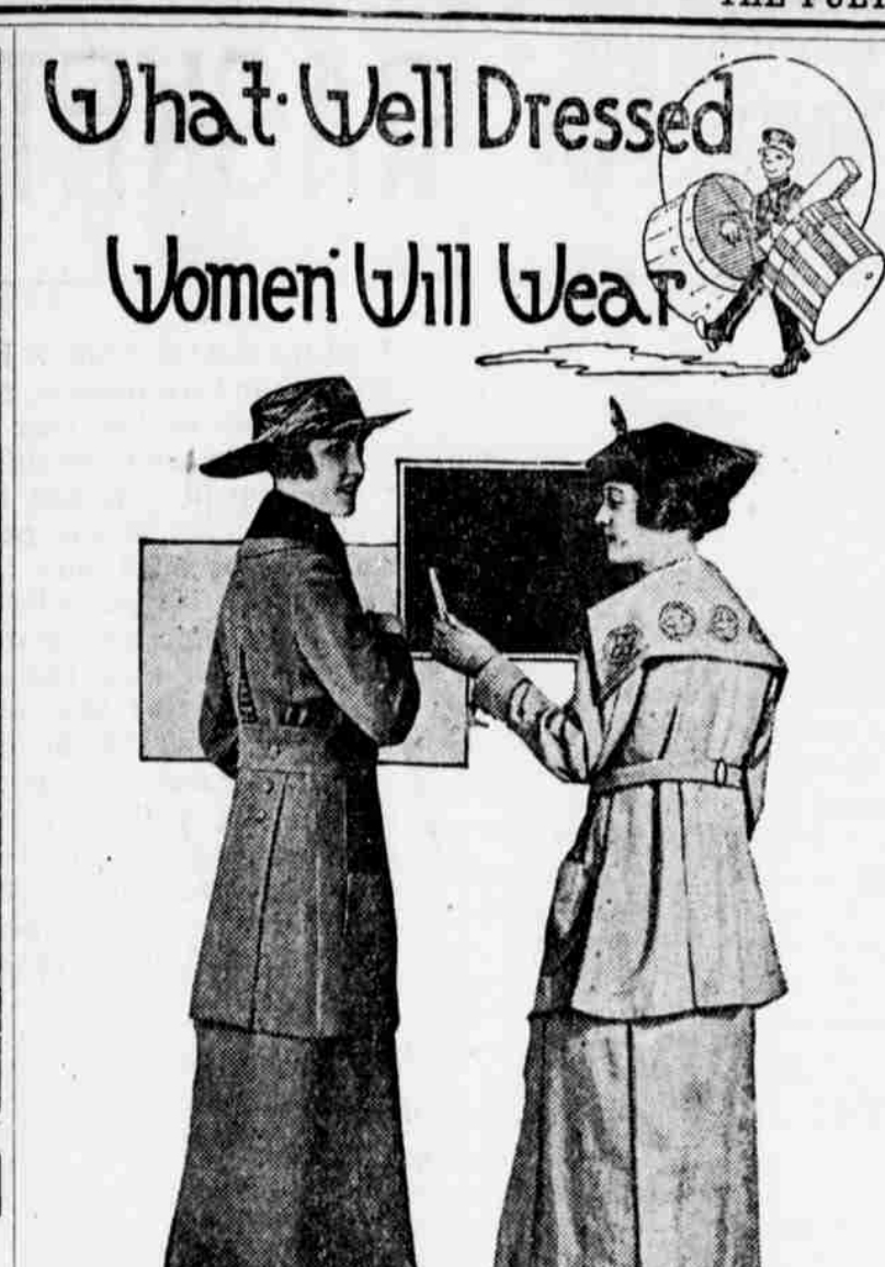
First of the New Fall Suits.

will be seen that they have several points in common but that the fall model shows departures in the direction of greater length in coats, in the nite lines, that give the figure a smart, well-set-up look.