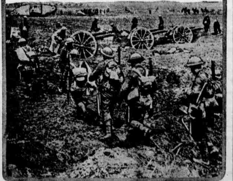
British official photograph showing British "tank" and artillery, cavalry and infantry in motion on the field along the British front in Belgium. It is seldom that even a British official photograph shows so much of pictorial value in one picture.

rages increased 103 per cent. In near-prohibition states, states in