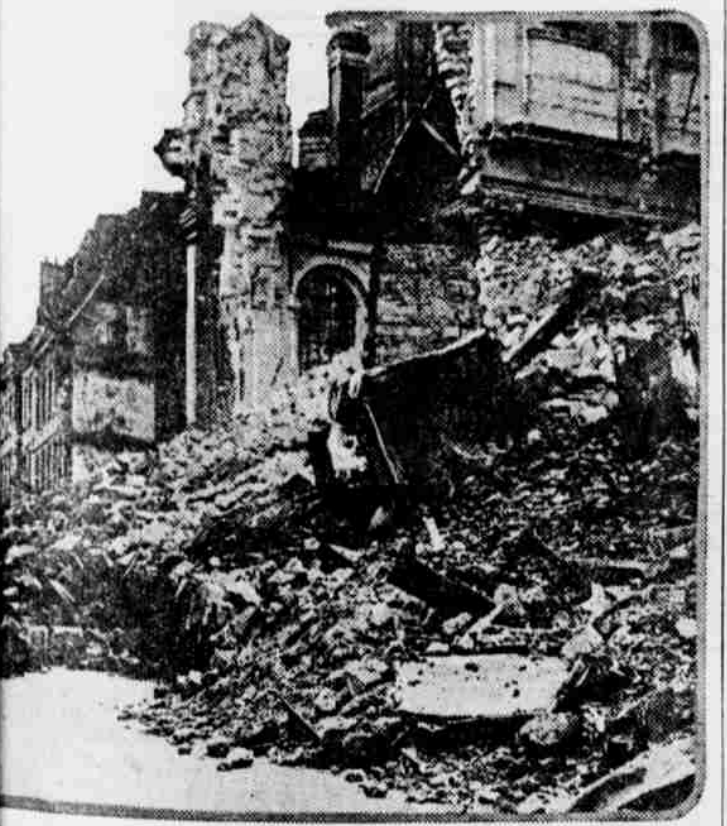
as spared by the Germans in their ravages in French towns. al cathedrals were wrecked irreparably. Almost every home is a mass When the British entered Arras they found this inconceivable ruins. The picture was taken outside the wrecked cathedral.