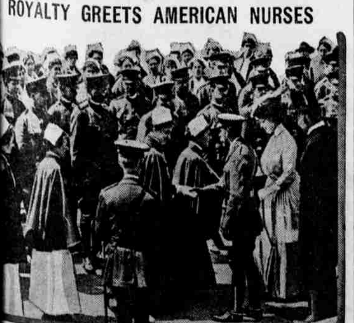
invitation of King George, the officers and nurses of base hospital 4. U. S. A., were received at Buckingham palace. The photograph ter. Put a piece of blotting paper in- They are fed regularly through the ir majesties shaking hands with the nurses as they passed by. hem stands Dr. Walter Hines Page, American ambassador.