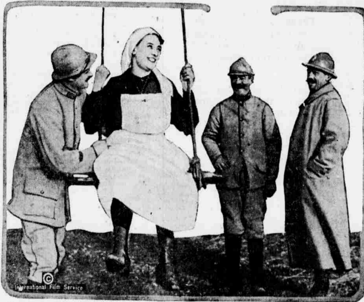
French soldiers giving one of their nurses a swing.