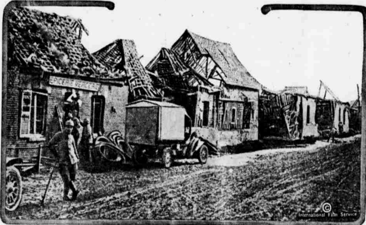
This is the main street in one of the French villages as it appeared after the allies had driven out the Germans.