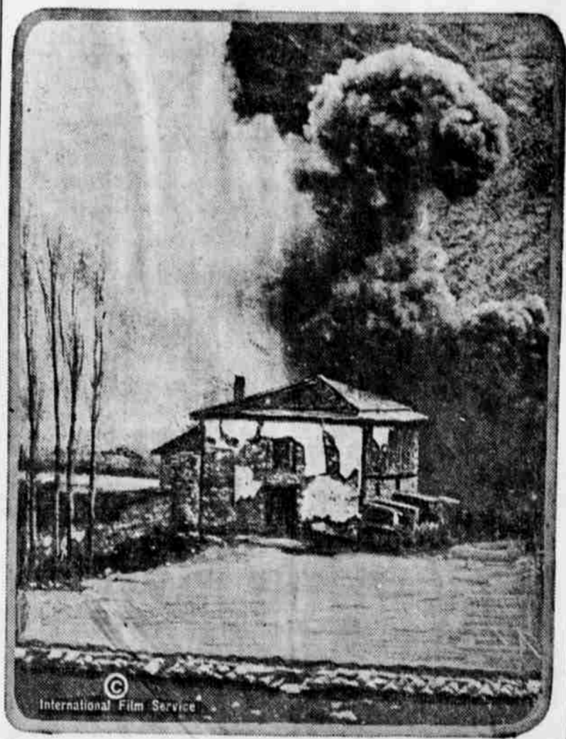
This munition depot of the allies on the Saloniki front was bombarded for a week, but the shells hit everything except the target.