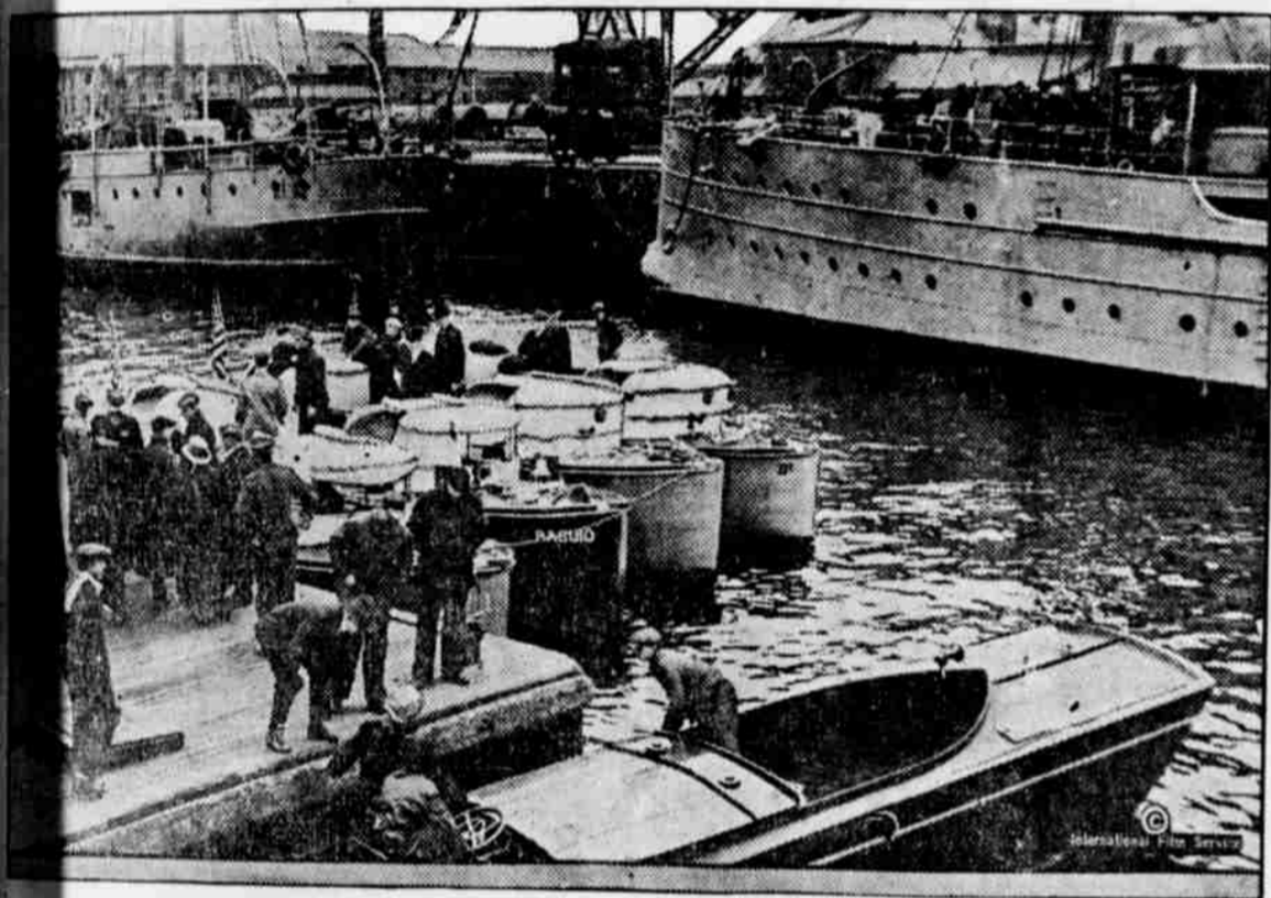
The government has been holding a series of tests for engines to be used in the submarine chaser fleet which is to be placed under command of Naval Constructor L. S. Adams. The four boats used in the test are shown