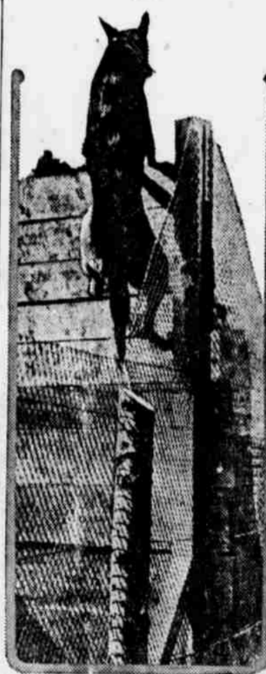
A sentinel watchdog. The dog has jumped to the top of the fence and is peering over the landscape for any possible prowlers. As a sentry he has few equals.