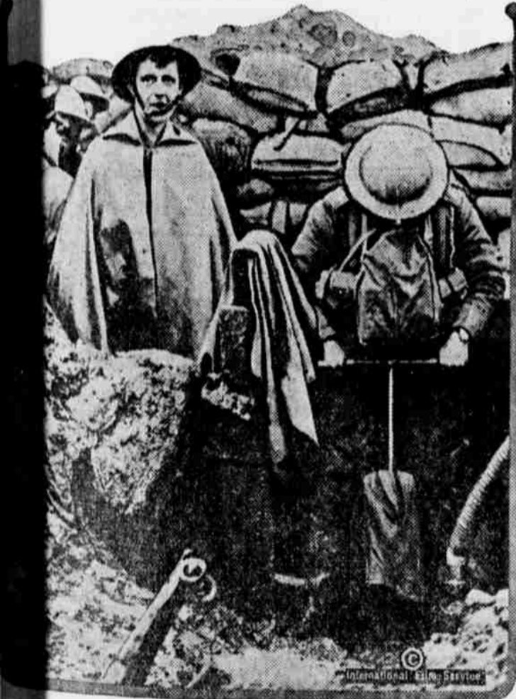
Soldiers using a pump in a front-line trench in northern France.