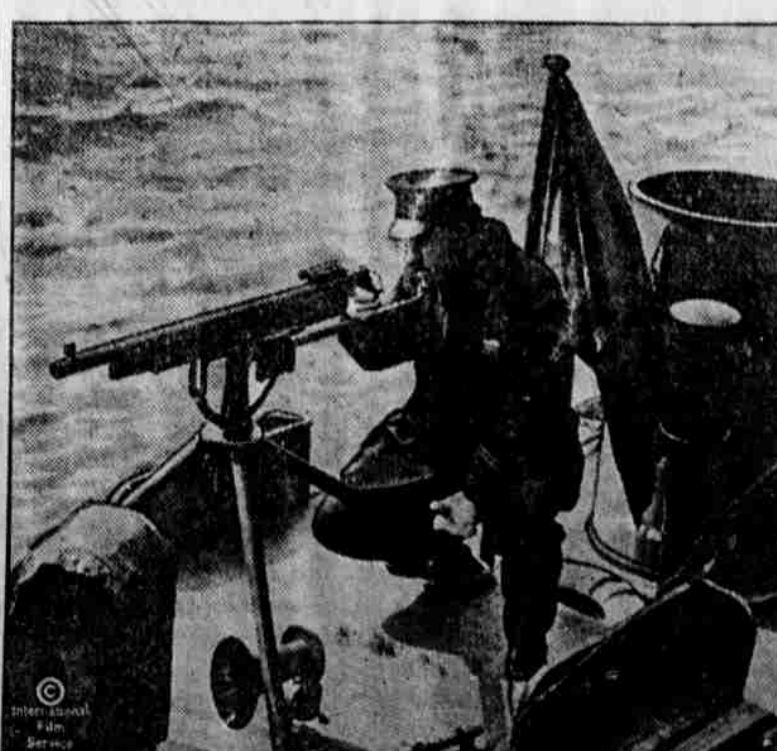
They use speedy launches equipped with machine guns. The picture shows a policeman manning a machine gun.