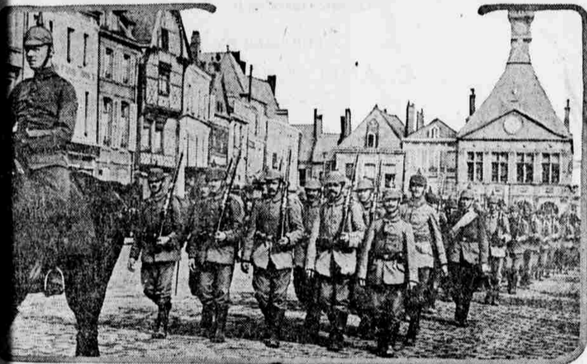
When the British entered Peronne the other day on the heels of the retreating Germans they found the place a mass of wreckage. On every hand was found evidence of the systematic destruction wrought by the Teutons. The picture was taken at the time the Germans first took possession of the town.