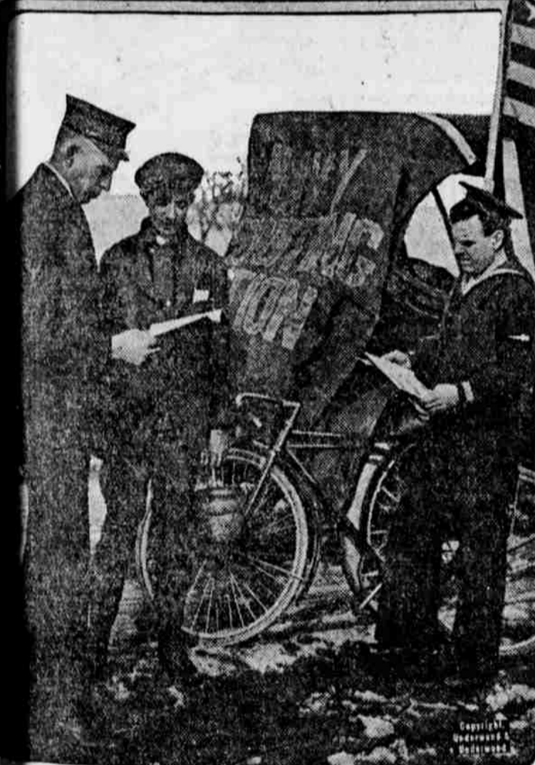
A petty officer explaining to a farm hand how he may be of help to his neighbor by serving on one of Uncle Sam's great fighting ships.