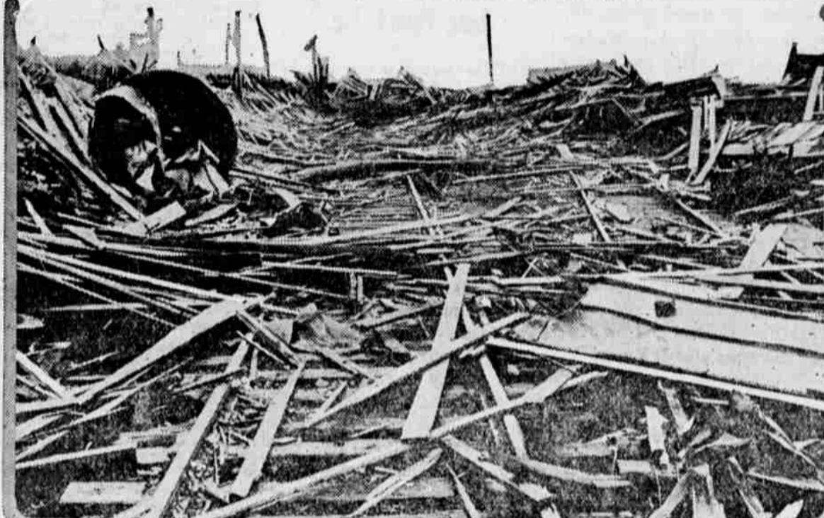
View showing the destruction wrought by the tornado which took a toll of 44 lives at New Albany, Ind.