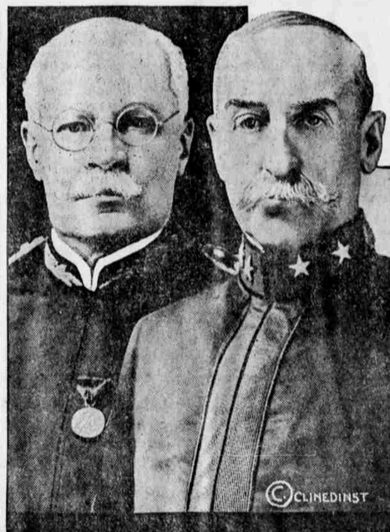
Gen. Hugh L. Scott (left), chief of staff of the United States army, and Rear Admiral William S. Benson, head of the great United States navy.