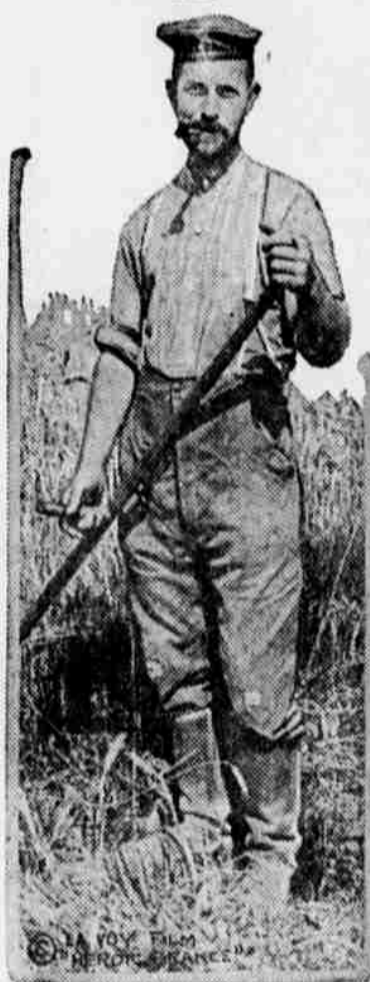
A German prisoner put to work in France.