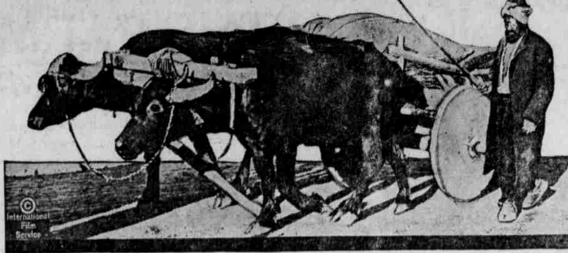
One of the bullock teams used by the Turkish army in transporting supplies. As may be imagined it is rather slow work, but the docile oxen are reliable creatures and usually can be depended upon to get there in time.