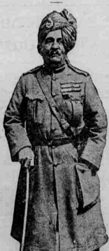
Sir Pertab Singh is one of Britain's most loyal colonial sons. He is an Indian of highest birth and is in command of the Indian forces fighting for the allies on the western front.