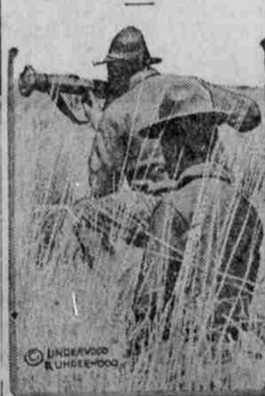
Soldiers of the expeditionary force practicing with the range-finder on the open mesa of the Mexican plain.