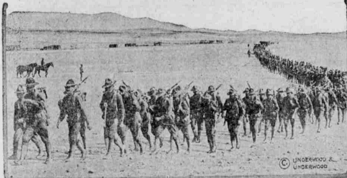
Companies D, E, F, G, and H arriving in camp "somewhere in Mexico" after a six days' hike across the desert.