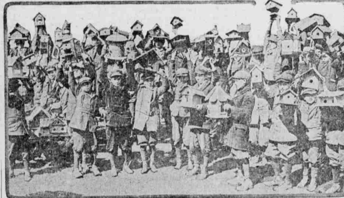
The boys of the sixth and seventh grades of the St. Paul, Minn., public schools with their birdhouses on their way to the bird exhibition held in the Auditorium, St. Paul. John Burroughs opened the exhibition by pressing an electric button at his home at Westpark, N. Y. Over 5,000 boys took part in this unique exhibition, and the hundreds of different designs of birdhouses excited the interest of thousands of visitors. The exhibition is in line with the movement to make St. Paul a city of birds and flowers.