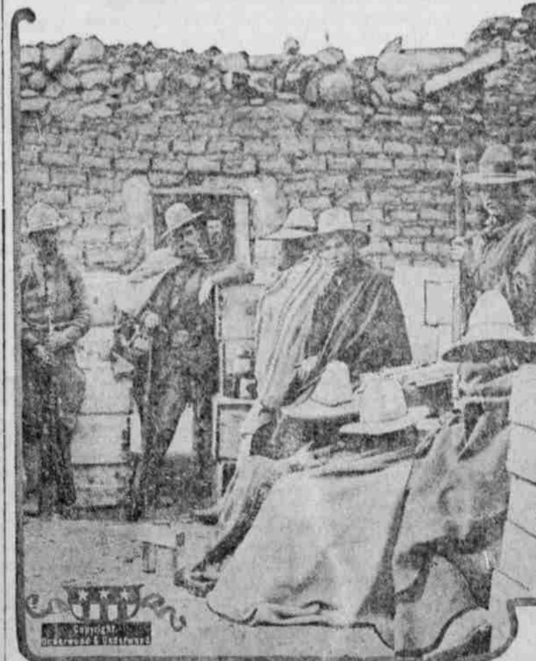
These Mexicans were members of the party that raided Columbus, N. M., and were picked up in the mountains. They are guarded by American soldiers.