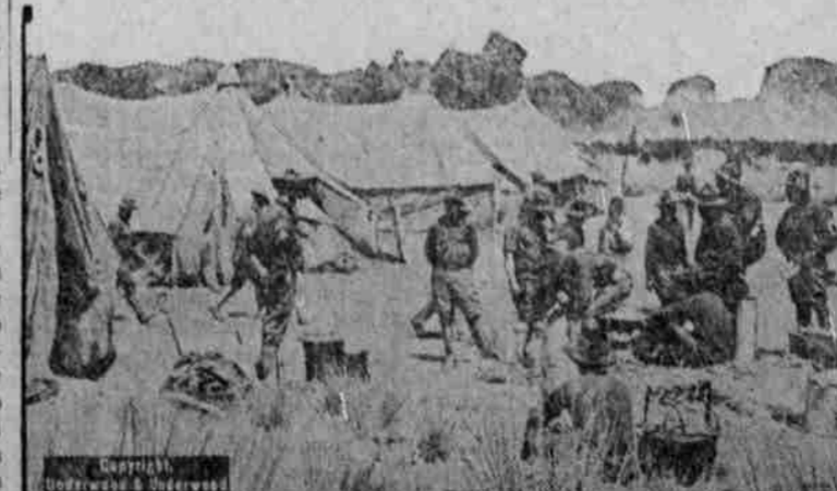
Seventh field hospital corps at Casas Grandes, where all the injured and the sick of the expedition are being cared for.