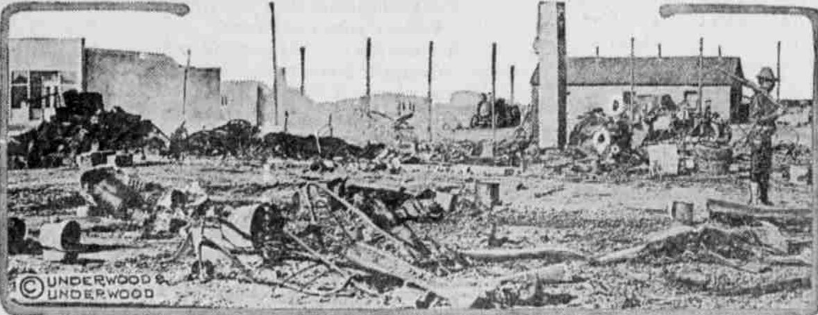
In the immediate foreground are the ruins of the Commercial hotel in which six Americans were killed and their bodies burned. On the right a soldier is seen on guard.