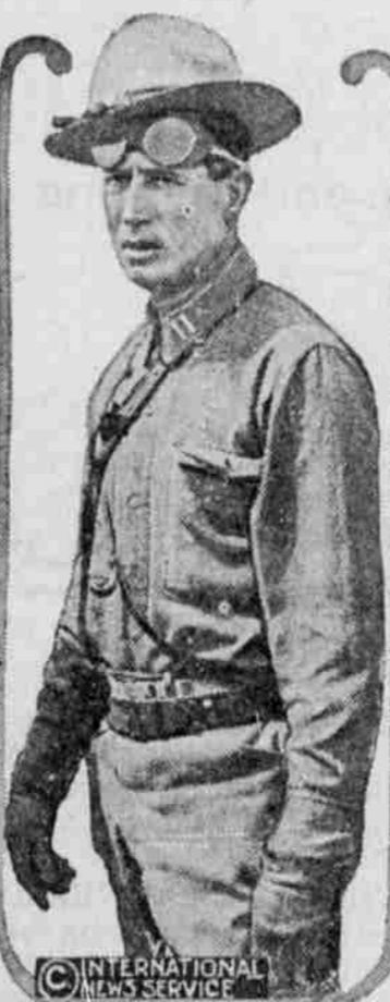
One of the officers of the Twentieth infantry ordered into Mexico in pursuit of Villa.