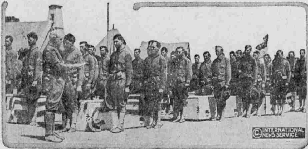
Funeral services being performed for the United States soldiers who were killed in the fight with Villa's band at Columbus, N. M.