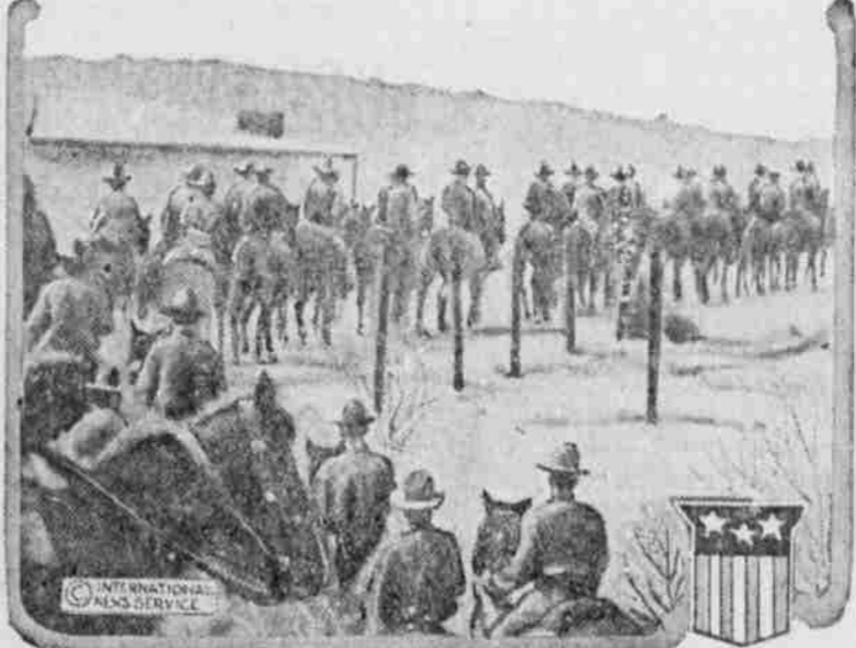
This photograph shows the Thirteenth cavalry crossing the border line near Columbus, N. M., in pursuit of the outlaw band under Villa.