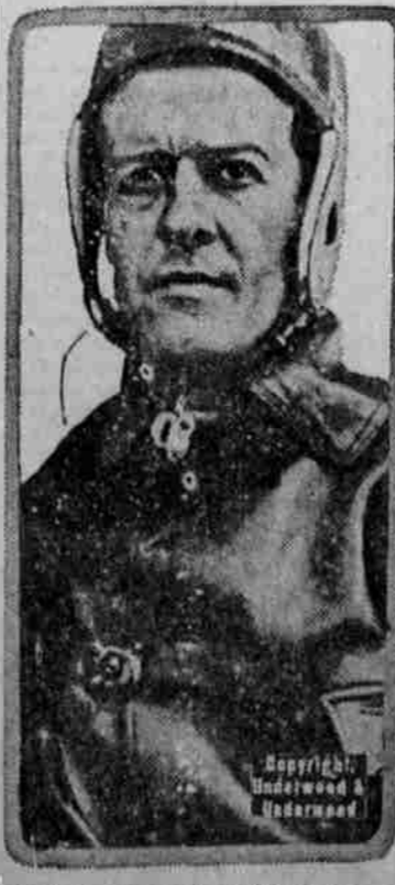
Captain Benjamin D. Foulois in command of the aero scouts with the United States troops in Mexico.