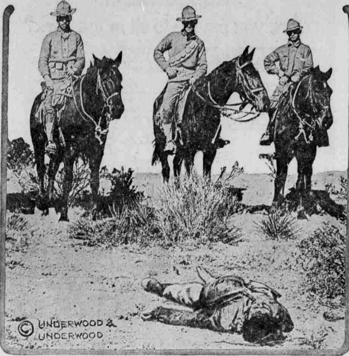
United States cavalry viewing the dead body of a Villa bandit killed in the flight from Columbus.