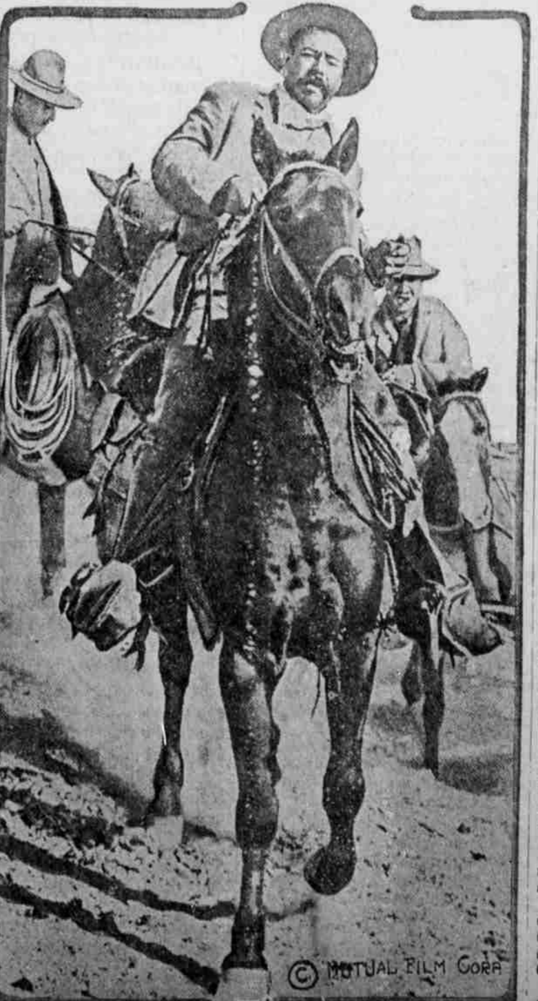
Chief of the marauding bandits seen in a characteristic pose.