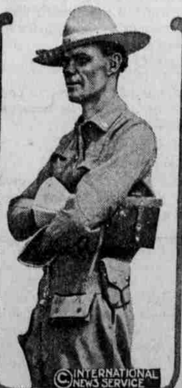
One of the subalterns in the punitive expedition into Mexico.