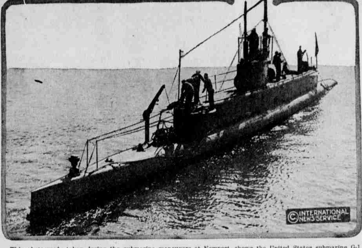
This photograph, taken during the submarine maneuvers at Newport, shows the United States submarine G-1 as the sailors were clearing her deck preparatory to submerging.

NEW BRITISH GAS HELMET LORD AND LADY ABERDEEN IN AMERICA