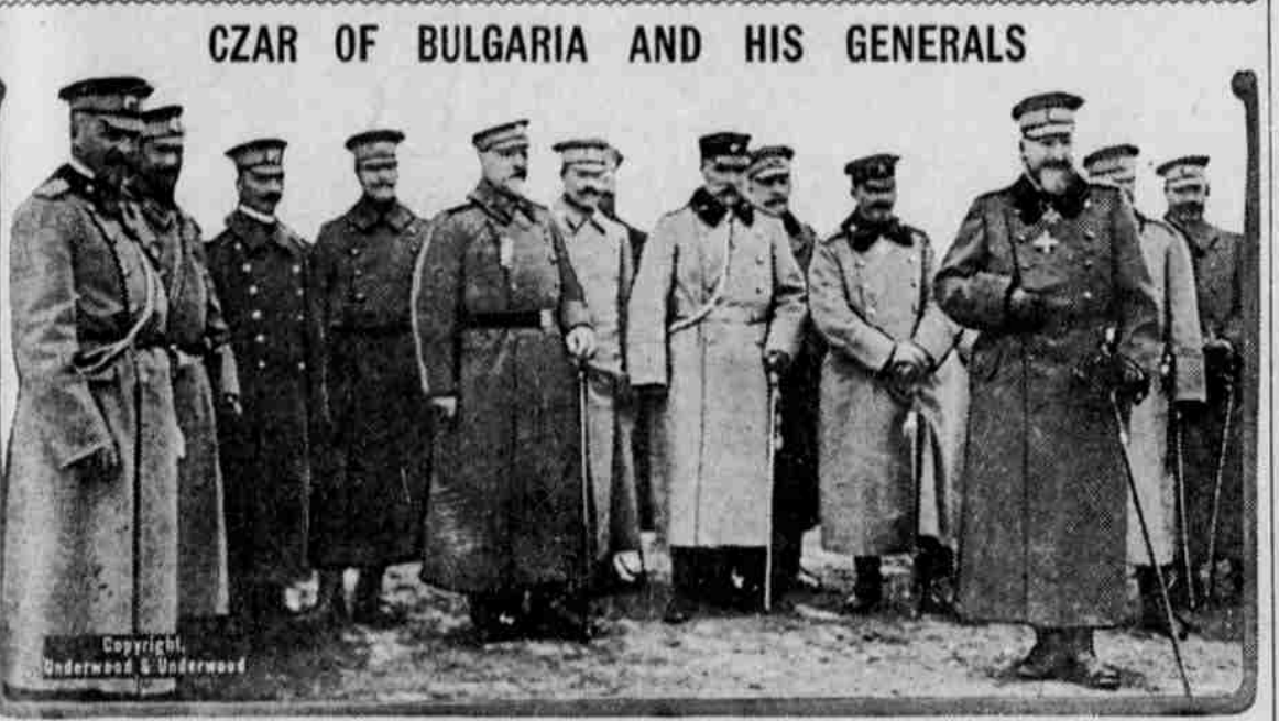
Ferdinand, czar of Bulgaria (in the right foreground), and the leading generals of the army with which is attacking Serbia

NEW BRITISH GAS HELMET LORD AND LADY ABERDEEN IN AMERICA