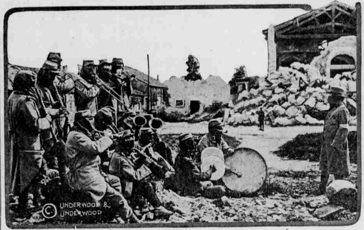
A highly interesting and unusual picture just from the Argonne district. The crown prince has been making attacks along this front in which polson gas was extensively used. Entire regiments go about constantly masked against the deadly fumes, and when during a lull in the fighting the regimental band got together for rehearsal in the ruins of a village they presented this grotesque scene.