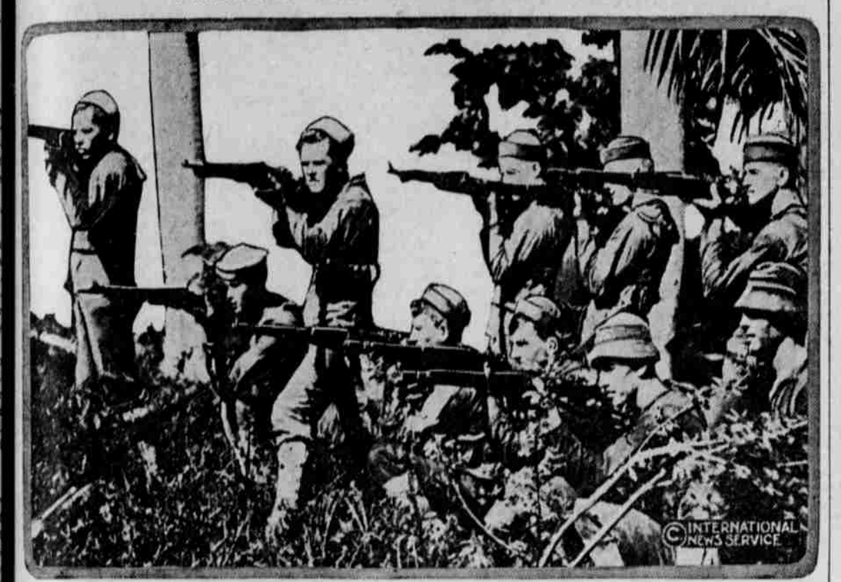
Biuejackets from the United States ship Washington are here shown ashore near Port-au-Prince, Halti, attacking party of rebels in the bush. The American forces have now about restored order in the black republic.