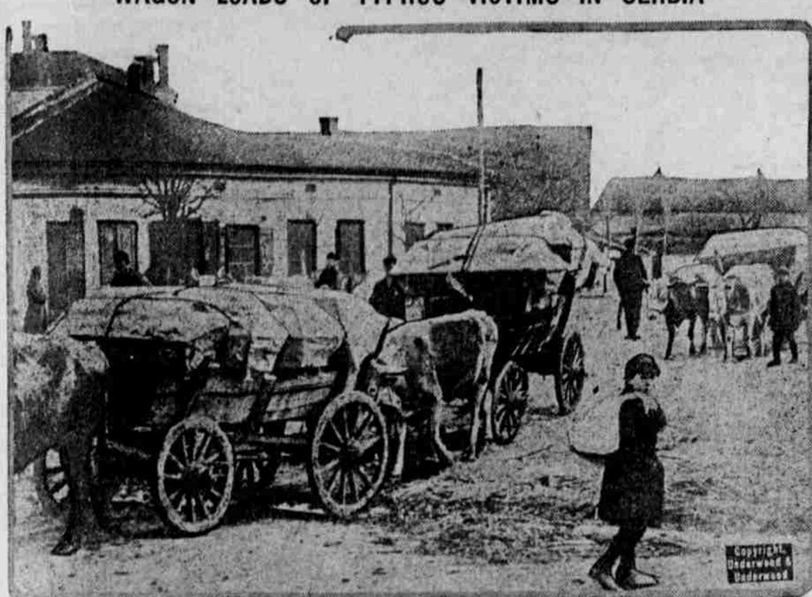
Typhus is making horrible ravages in the ranks of the Serbian and Austrian armies, and among the civilians as well. The death rate is frightful, and ox carts laden with the coffins of the victims pass in continual procession to the burial places.