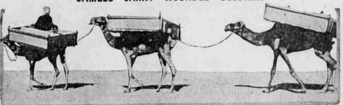
as a beast of burden in the East, refuses to be ousted by any new-fangled inventions. In the desert it is still indispensable, and is now being used for carrying wounded in the manner shown.