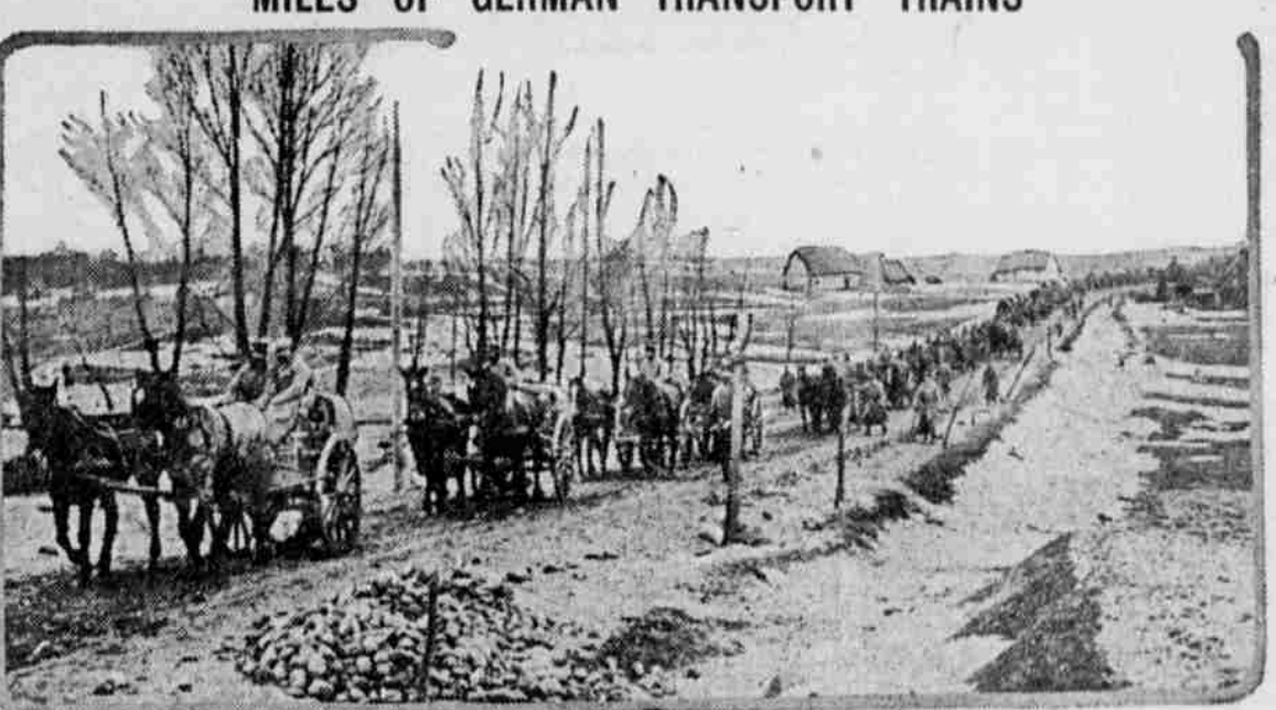
Photograph taken near Suwalki, Poland, while transport trains of the German army, miles long, were passing along the wintry road.