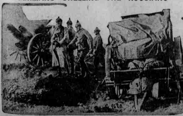
This photograph of a German battery shelling a force of Russians was Obregon has been administering some

taken not far from Lodz, Russian Poland.