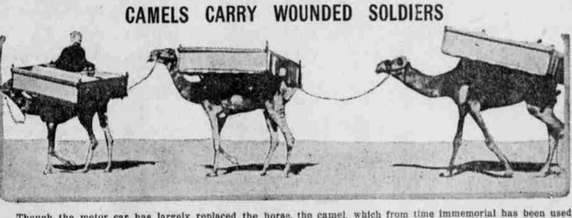
Though the motor car has largely replaced the horse, the camel, which from time immemorial has been used

Two Kinks of Religion-Both Bad. "Dar's de man dat takes his refigion in spasm, and gits over it 'bout as cuick," tated good old Parson Bagster. "And den ag'in, dar's de yudder kind lat has it all de time, and 'magines his whole duty is done when he says 'Amen!' in a deep voice. And I dunnuh, sah, which of 'em gives me de least sadisfaction."-Ka City Star.