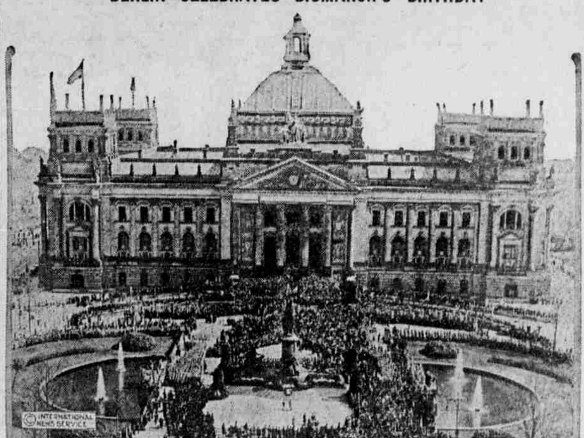
General view at the Bismarck monument in Berlin on the occasion of the hundredth anniversary of the birth of the Iron Chancellor.