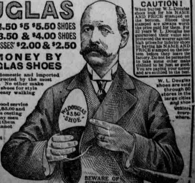
BEWARE OF SUBSTITUTES

If you could visit the W. L. Douglas factory at Brockton, Mass., and see how carefully the shoes are made, and the high grade leathers used, you would then understand why they look and fit better, hold their shape and wear longer than other makes for the price. If your dealer cannot supply you, write for Illustrated Catalog showing how to order by mail. W. L. DOUGLAS, 210 Spark St., Brockton, Mass.