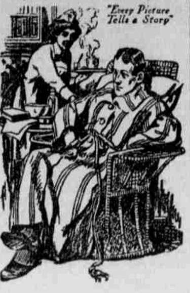
"I'd be all right only for my back."

This sensible treatment should bring quick benefit and prevent serious kidney diseases like dropsy, gravel and Bright's disease. Clip this advertisement and mail it to the address below for a free trial of Doan's Kidney Pills, the best rec-