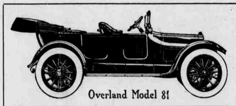
Overland Model 81

Full streamline body. Floating type rear axle. Electric starting and lighting. Left hand drive. Finish, Brewster green with ivory striping.