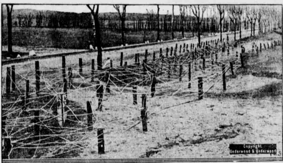
All along the German-Russian border barbed wire entanglements have been erected by both the Germans and the Russians as a protection against raiding parties from either side. The photograph shows one of these barbed wire entanglements and barricades. All along the road, on both sides of it, are huge stones, painted white. Guards have been placed along the lines to give alarm when a raiding party is seen. These guards are dressed so that they take on the appearance of the wayside rocks. Under the tree in the foreground may be seen one of these guards wearing a white great coat.