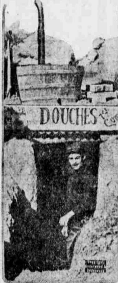
To keep an army personally clean is one of the immense tasks that confront the commanders. The photograph shows a shower bath contrived in the French trenches north of Soissons, only a hundred yards from the German lines.