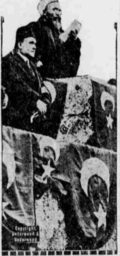
The Sheik-ul-Islam, Turkish high priest, proclaiming the holy war against the allies, in front of the Mosque of Faith in Constantinople.