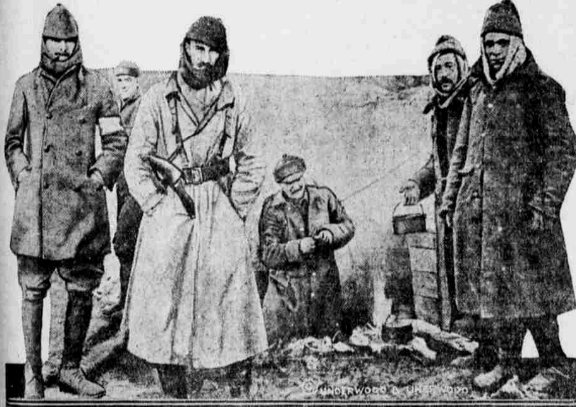
British officers, privates and Red Cross men in the trenches trying to keep warm around a fire while their food is being prepared.