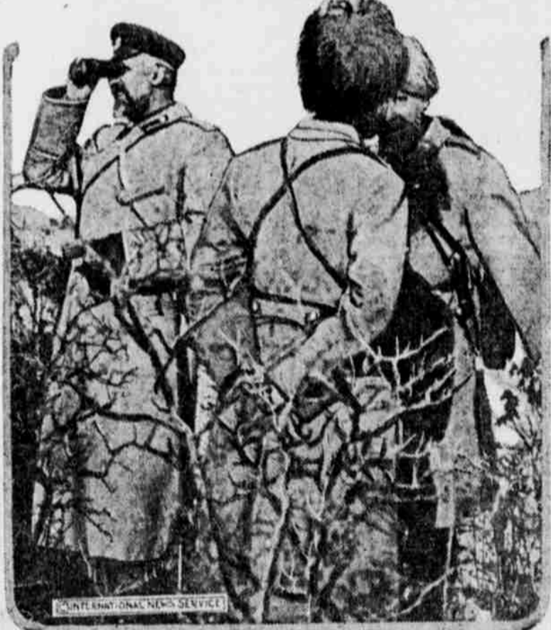
Russian officer with Cossack scouts making observations of the position of the Austrian troops in the vicinity of Cracow.