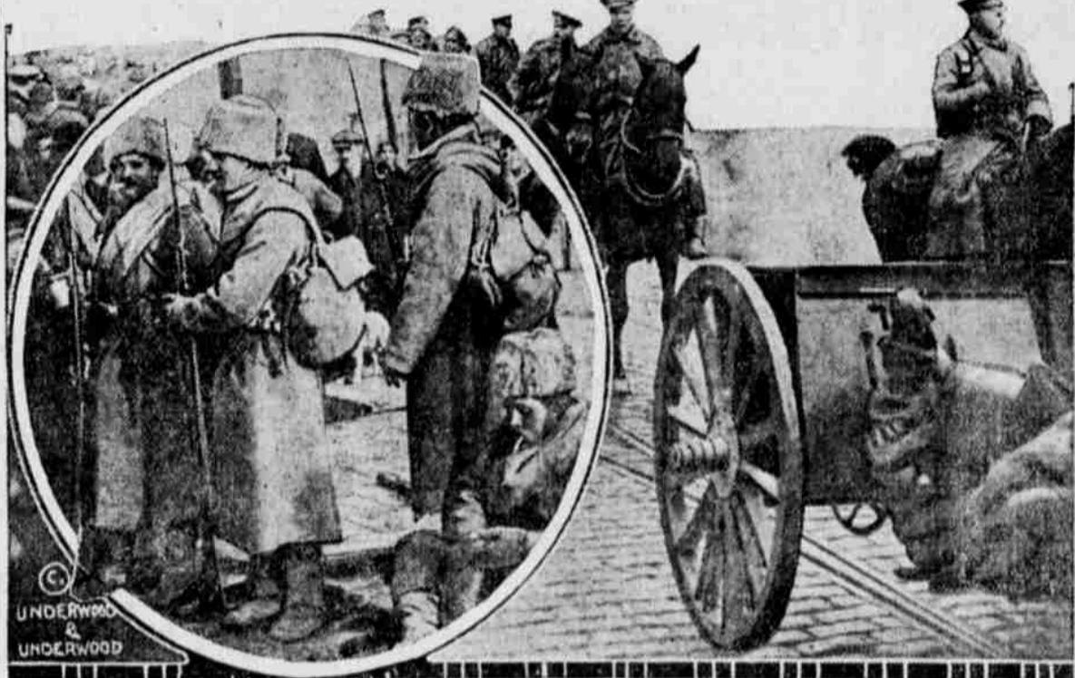
Siberian artillery and (inset) infantry photographed in Warsaw just after their arrival there to help defend the city against the German army.