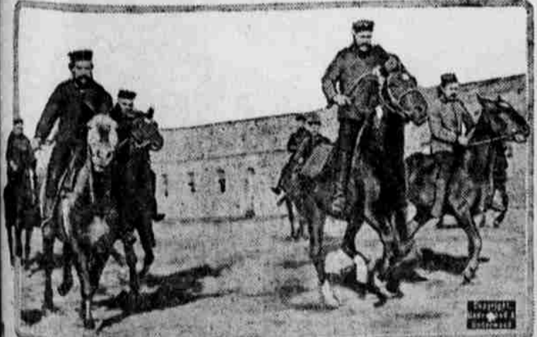
Men of the German landsturm patrol on the East Prussia frontier riding on Cossack horses captured from the Russians.