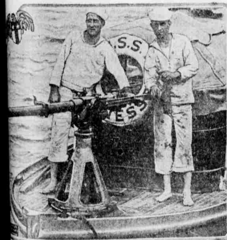
This is the launch of the U. S. S. Tennessee at which a Turkish fort in Smyrna fired a shot, which afterward was declared to be only "friendly" warning that the harbor was mined and closed to alien vessels.