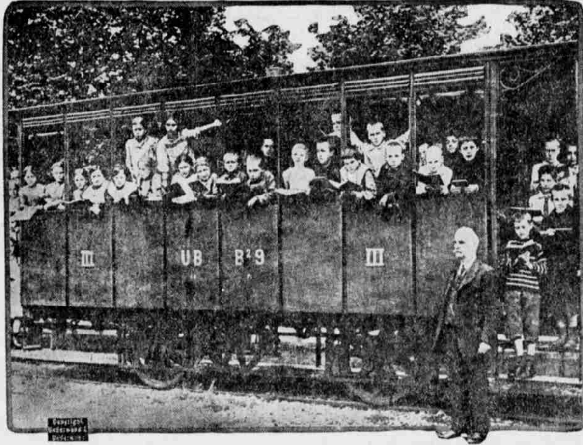
To accommodate the wounded soldiers who are brought back from the battle lines, the schools of Germany have been converted into hospitals; and in order to provide for the children, whose studies otherwise would be interrupted, railway cars are being used as classrooms, as shown in the photograph.