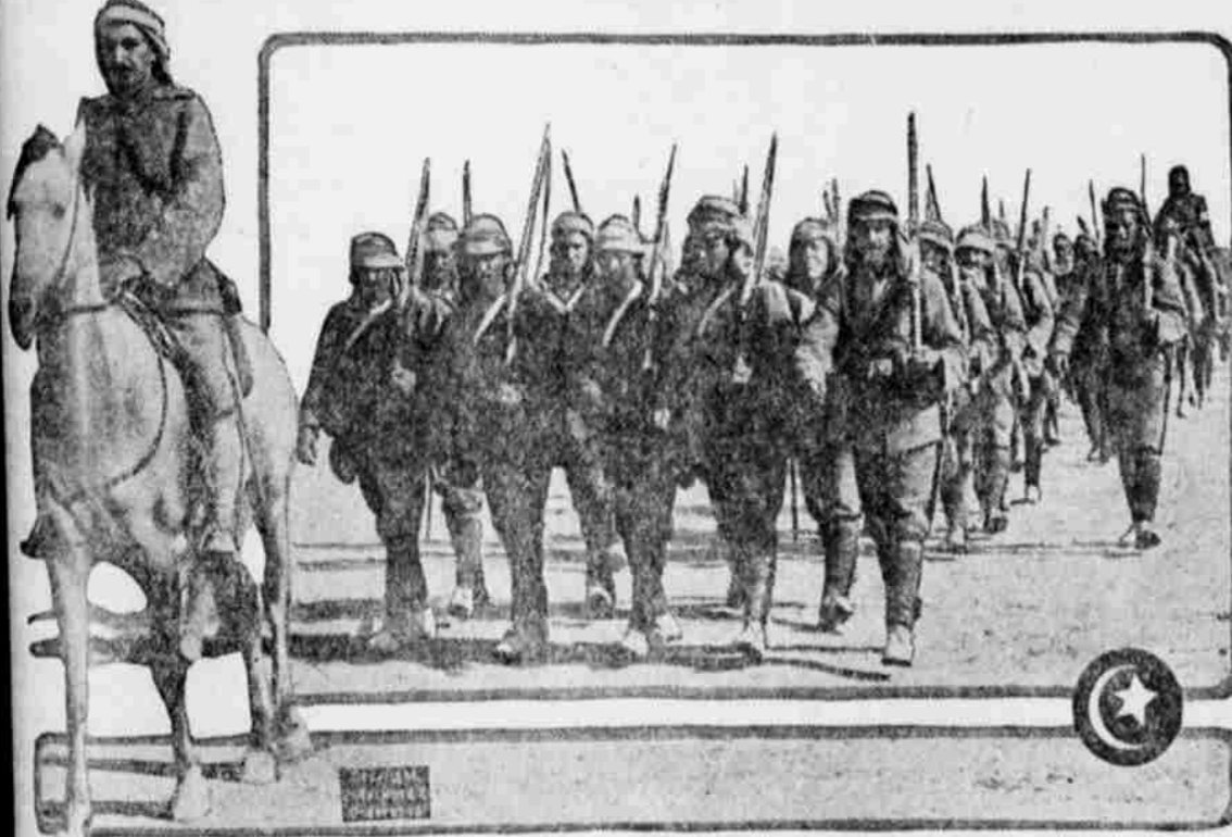
Regiment of Turkish regular infantry, drilled by the Germans and wearing their new khaki uniforms, march across the desert to meet the Russian troops on the Caucasus border.