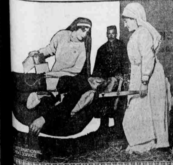
French women, well known in society, attending wounded soldiers at the front in the Nord as they arrive from the battlefields.