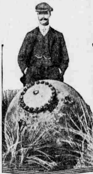
This big steel ball is one of the deadly mines that are feared by all navigators. It was washed ashore at Sizwell, Suffolk, and its explosives were removed by a torpedo instructor. Many of these mines have been beached along the coast of England.