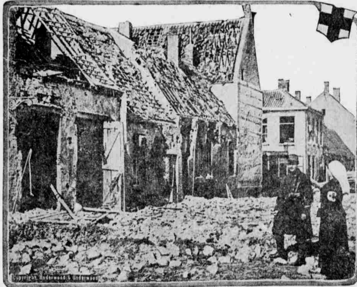
Shells from the German guns were still falling into Nieuport when this photograph was taken, showing Red Cross workers searching the ruins for any who might need their help.