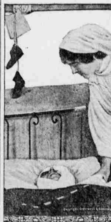
Two little shoes found in the pockets of a mortally wounded Belgian soldier touched the heartstrings of the nurses in the French hospital to which he was taken. With them was a letter to his wife, from whom he had been separated since the destruction of their home in Termonde, saying he was sending a pair of shoes for their three-year-old baby, bought with money he had earned as a scout in King Albert's army. The shoes were hung above his deathbed.