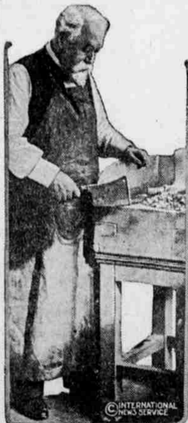
Sir Hiram Maxim, the famous inventor, chopping pork to be used in his gift to the Canadian troops, which consists of 25,000 one-pound tins of pork and beans, prepared by himself and cooked by the method followed by the lumbermen of Canada.