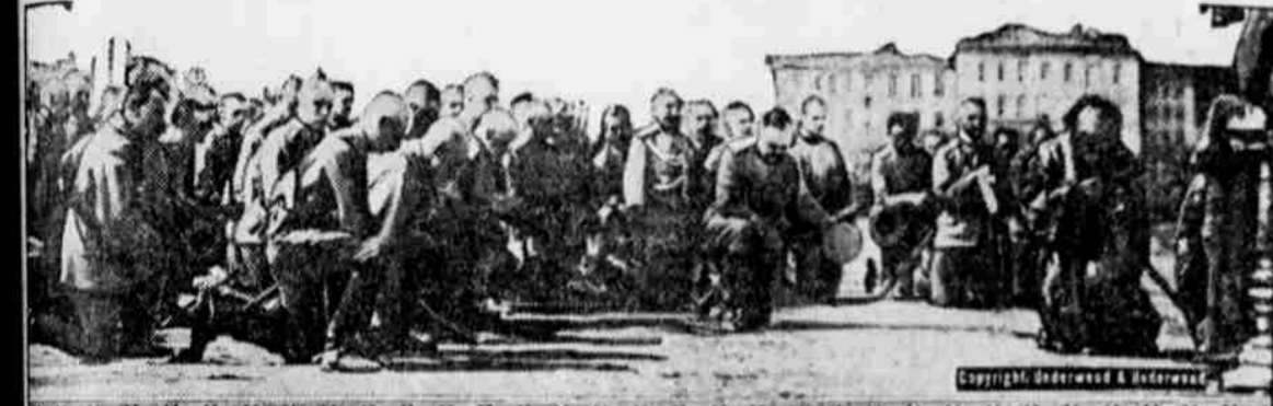
Officers of the famous Preobrazhensky regiment of the Russian army kneeling in prayer for the divine blessing before going into action.