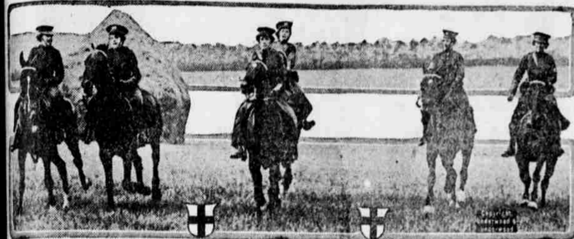
Woman riders of Great Britain have organized the Women's First Aid Nursing Yeomanry corps to help the fighters in the field. The photograph shows some of the members of the corps riding across open country.