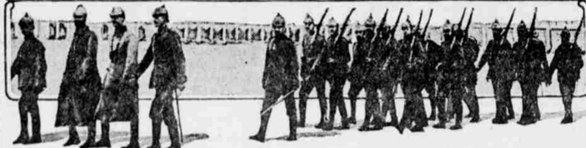
Above, German infantry, deflected from Ghent and Bruges, passing through Blankenburghe, just outside Ostend. Below, the Kaiser's infantry which entered Ostend, marching along the sands of the North sea at that port, which they hoped to utilize as a base of operations against England.