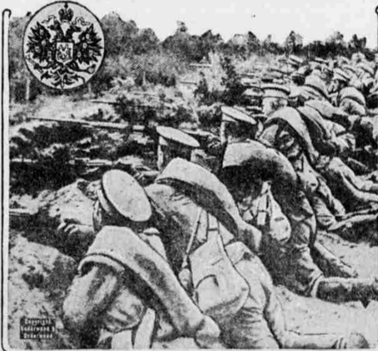
The success of the Russians in Austria is said to be due largely to the precision with which they are moved from one position to another. A detachment of the infantry is here shown in the trenches.