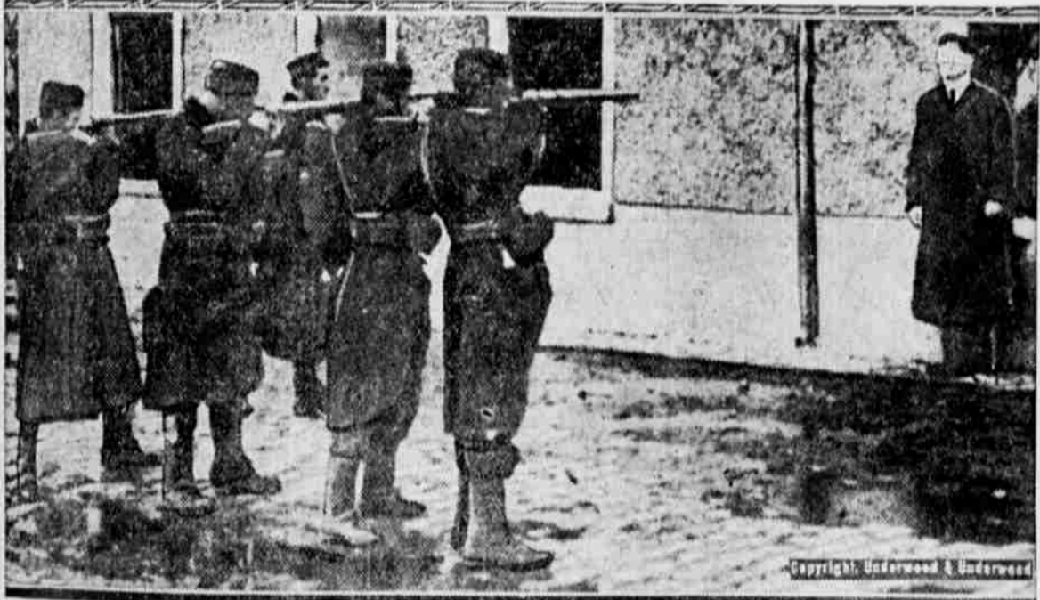
Execution of a German spy, who was caught by the Belgians near Termonde. He was led out at dawn, blindfolded and shot.