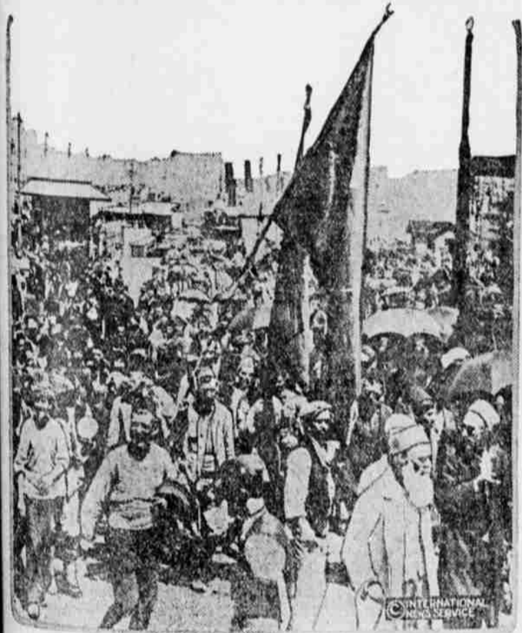
Scene in Constantinople showing Turkish recruits hurrying to the mobilization center to be ready to take part in the war.