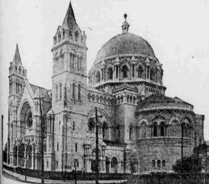
This new Catholic cathedral in St. Louis, just opened, compares favorably with the largest church edifices in the world and ranks among the most impressive in America. It is 306 feet long, 212 feet wide, and the main tower is 127 feet high. The seating capacity is 3,500. The cathedral has been under construction six years and so far about $1,500,000 has been spent on it. According to George D. Barnett, the architect, as much more will be devoted to the completion of the interior.