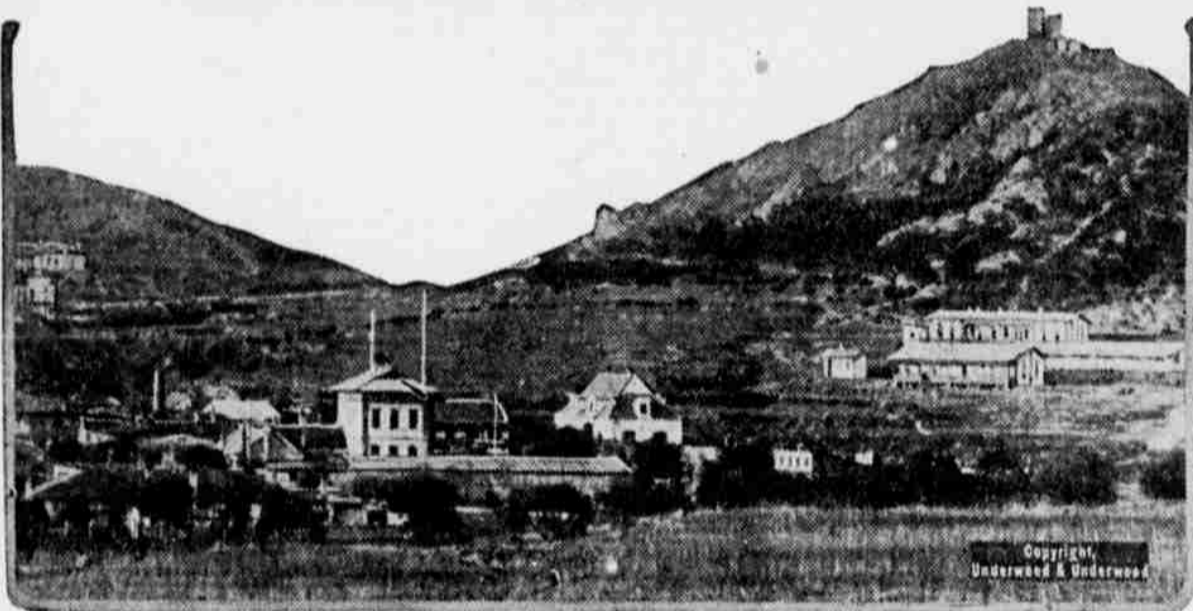
Situated on the high hill at the right of the photograph is the most important of the German forts at Tsing Tao, China. It is also a signal station. The entire hill is covered with intricate entrenchments and the emplacement for big guns are cleverly concealed.