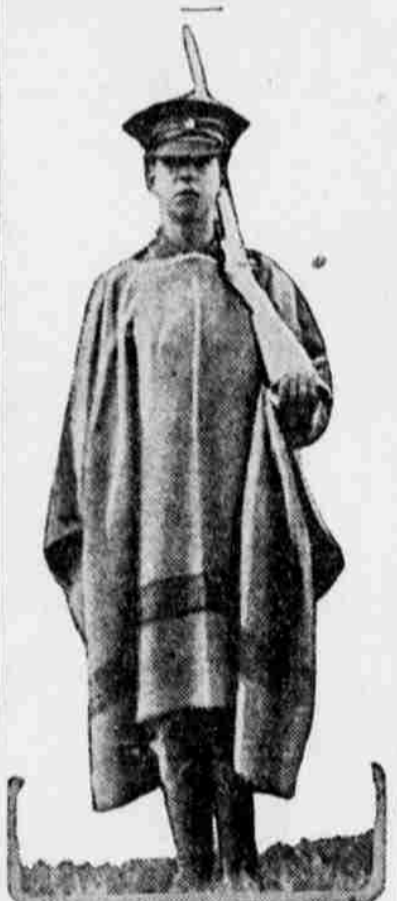
Owing to a shortage of overcoats for the British troops on the continent, the army authorities have adopted an American idea, and are making overcoats out of blankets. A slit cut in the center and stitched around forms the head opening, and a button and loop at each center extremity form the cuffs. The belt may be worn outside.