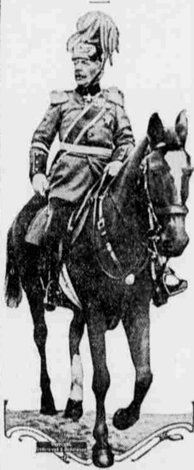
This photograph of General von Emmich was made during field operations in Belgium after his forces had achieved the capture of Liege, for which he was personally thanked by the Kaiser.