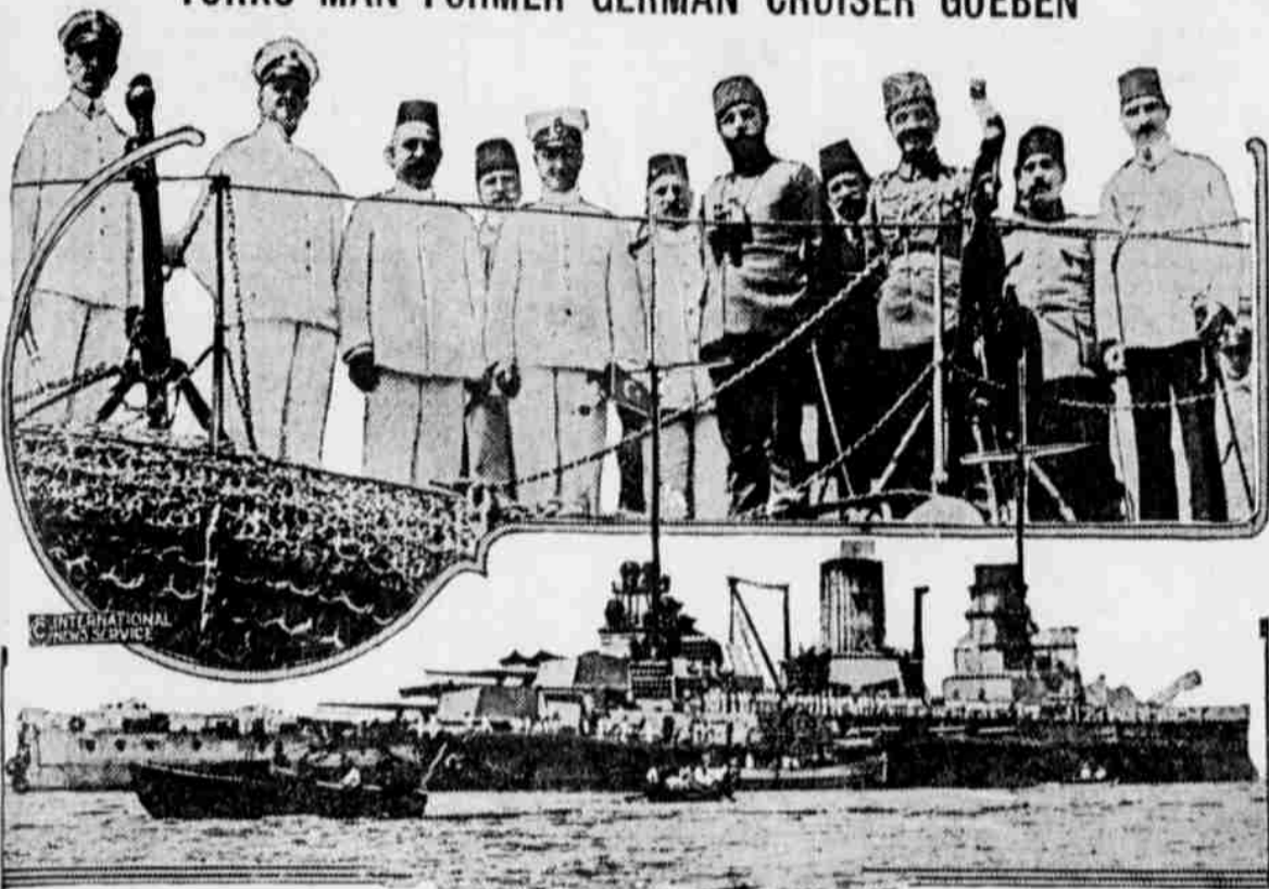
Former German cruiser Goeben, which the Turks purchased and renamed the Yavuz, photographed on the Black sea flying the Turkish flag. Above, photographed on board the Yavuz, are the Turkish naval minister, Djemal Pasha, and Admiral Sached, together with other Turkish officers and several German naval officers.