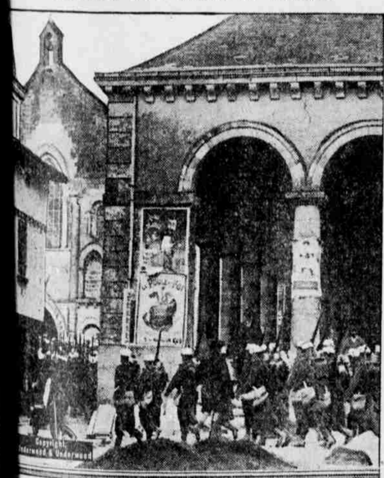
German spies placed posters in many French towns, the placards ostensibly advertising a soup preparation, but actually telling, by their color and the conditions which an invading army would encounter at each place, which troops are here seen passing a building on which is one of these signs.