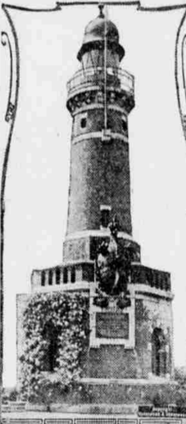
The extinguishing of this light might enable the German fleet to slip by the British fleet, which is supposed to have been waiting to engage the enemy outside of Kiel harbor.