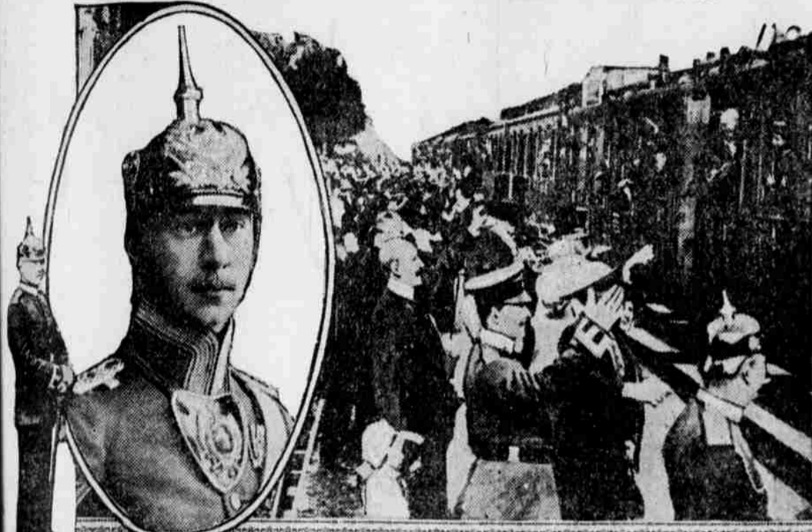
Trainload of German reservists on the frontier on their way to the front. Inset is the crown prince of Germany, who several times has been reported wounded.