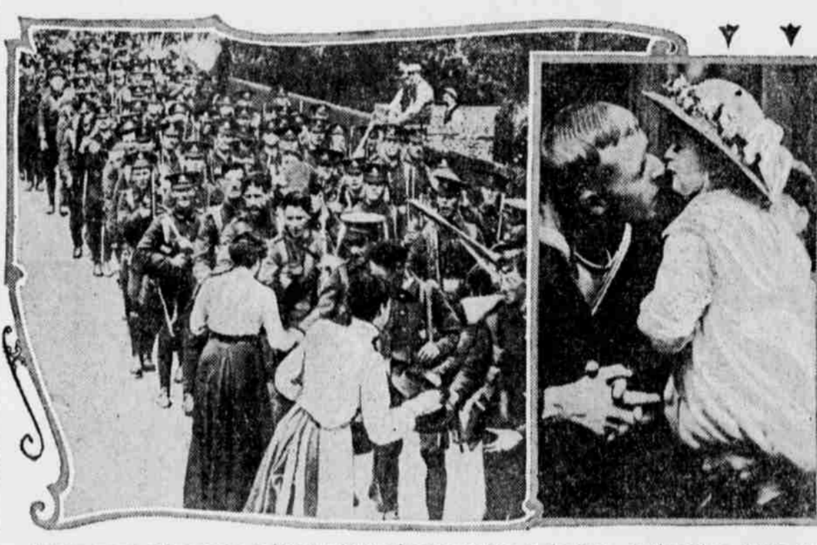
Country women giving apples to British soldiers who are marching to the front. At the right a British blue-jacket kissing his child good-by at Waterloo station.