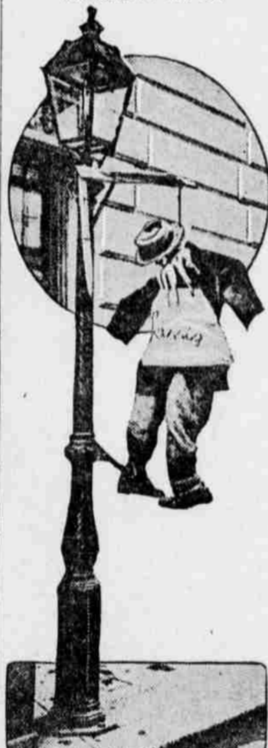
The premier of Serbia hanged in effigy to a lamppost in Budapest.