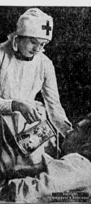
Servian women from all walks of life have joined the Red Cross.