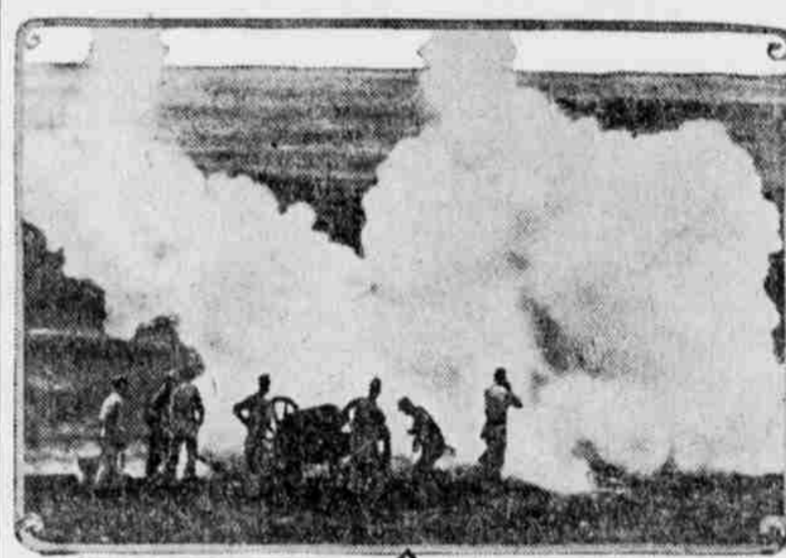
Austrian fieldpiece firing at the Servians during the battle near Semlitz.