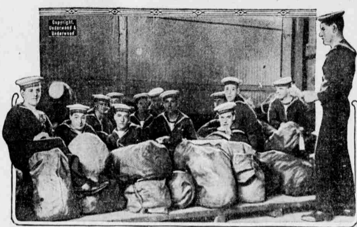
Last inspection at the headquarters of the Royal Naval Volunteer reserves the day they were mobilized in consequence of the king's proclamation.