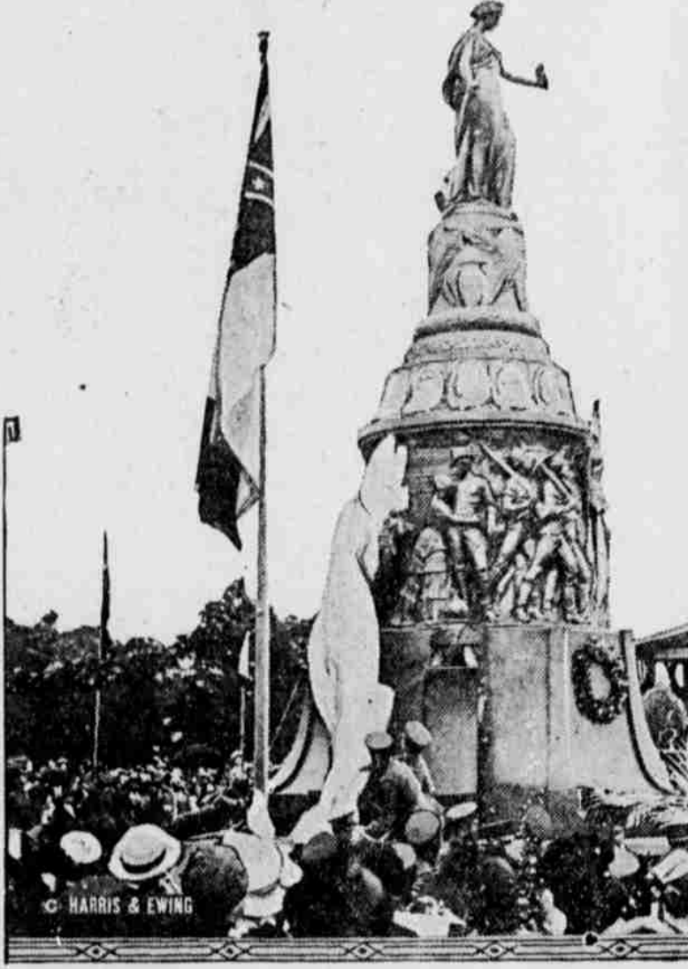
View of the monument to the Confederate dead in Arlington National cemetery as it looked just after the unveiling, in which President Wilson took part. The monument is of bronze and stands on a base of dark gray polished granite. Sir Moses Ezekiel was the sculptor.