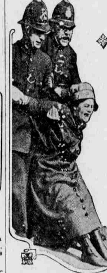
One of the militant suffragists who attacked the gates of Buckingham palace struggling in the grasp of the "Bobbies" that frustrated the raid. The women have so exasperated the authorities in London that the police now handle them as they would male offenders.

A Cheering Effect. "What influence has cubist art had on civilization?" "Well," replied the eminent alienist, "it has had a refining influence out at our asylum. A number of rooms that used to be referred to as cells are now called studios."