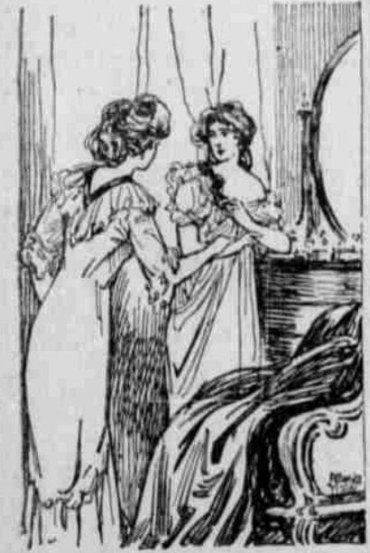
"You Did Not Know He Had a Wife?" She Cried.

"Oh, I think she understands us perfectly," said her brother.