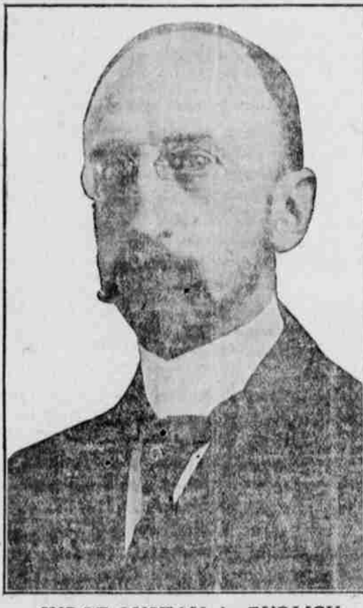
JUDGE GUSTAV A. ENDLICH A JURIST OF STATE, NATIONAL AND INTER-NATIONAL REPUTATION

This County Has Taken Part in the State-Wide Non-Partisan Movement to Place Judge Endlich, of Berks, Upon the Bench of the Supreme Court