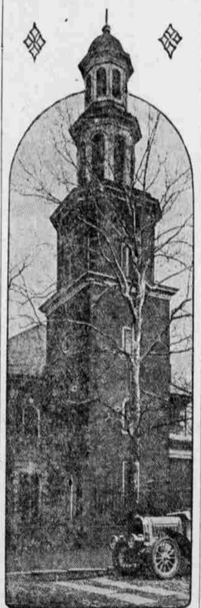
Christ Church, Alexandria.

Of Christ church was a frequent attendant, as business often called him to Alexandria (which place was his