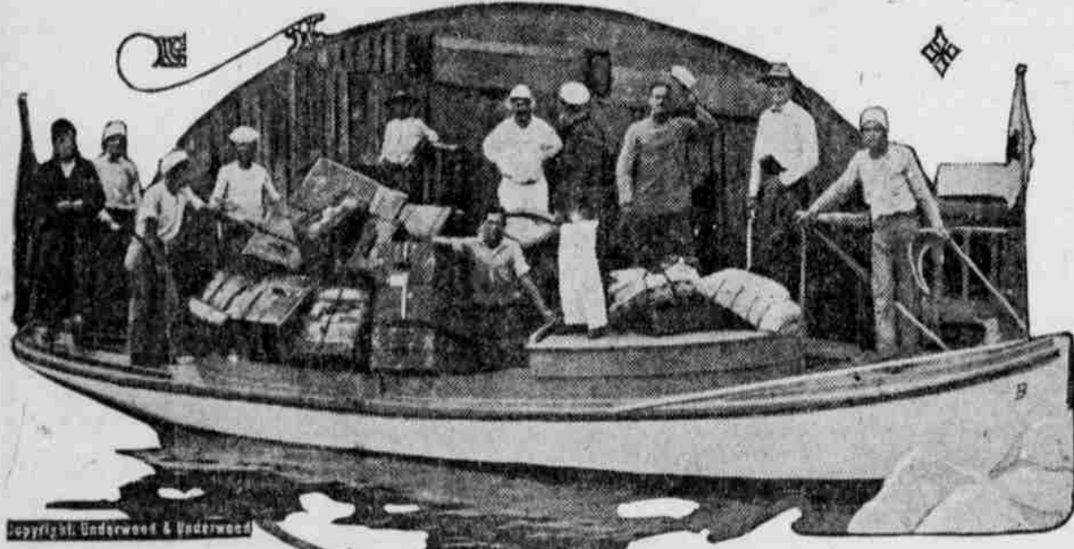
President Wilson's action in lifting the embargo on arms caused a general exodus of Americans from many places in Mexico. Our photograph shows American refugees and their baggage on a tender of the United States army transport Buford fleeing from Mazatlan.