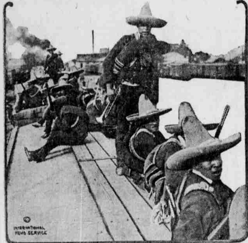
Huerta's rurales aboard a train bound south to protect Mexico City from the rebels threatening the capital from that direction.