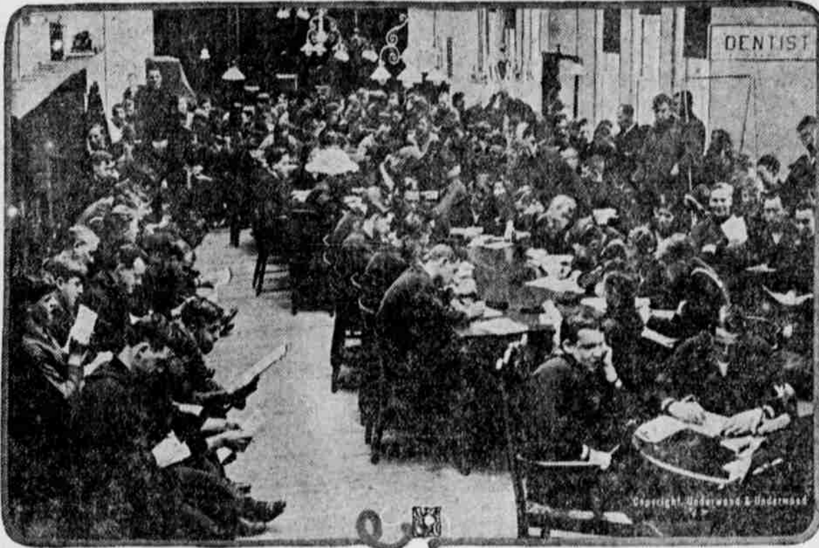
The biggest school in the world has just been opened and the scholars have taken to their studies as a fish takes to water. Aboard every ship in Uncle Sam's navy there is now a fully equipped school room, and to the great pleasure of Josephus Daniels, secretary of the navy, originator of the plan, there hasn't been a hitch so far. Every enlisted man and every officer is compelled to attend the classes. The photograph shows the academic department on the U. S. S. Washington.