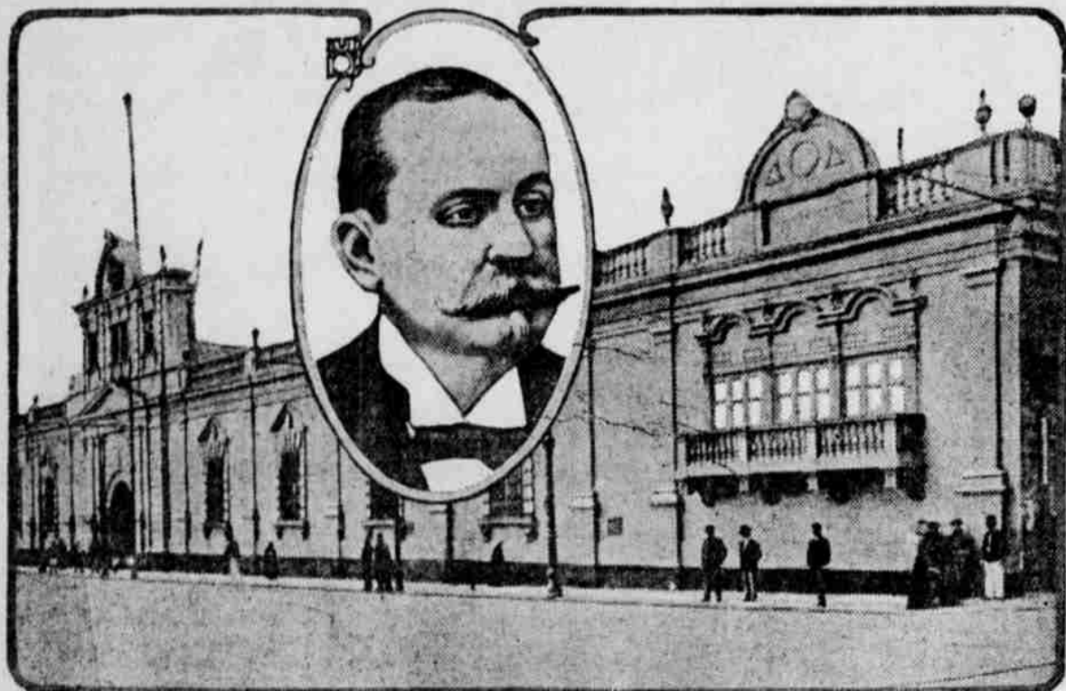
The rule of Guillermo Billinghurst, president of Peru, came to an end the other day when he was seized and arrangements for his banishment made. The congress thereupon appointed a board of governors. Our illustration shows the national palace in Lima and Billinghurst.