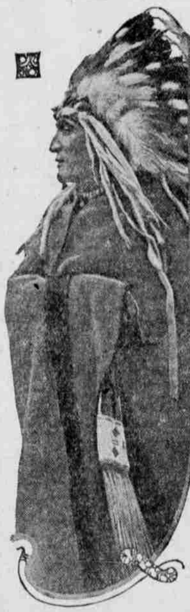
Chief Lazy Boy (Pah-kops-co-ma-pl), one of the noted warriors of the Glacier National park Blackfoot tribe of Indians, was recently made an honorary member of the Adventurers' club of Chicago. The only other honorary member of the club is Theodore Roosevelt. Lazy Boy has been in many exciting battles with the Sioux, Crow, Nez Perces and Kootenai tribes.

His Face Called for a Touring Car. That it is expected of some very plain women to have money in their own right, and some very unattractive men to possess motor cars in order to maintain their popularity, was shown the other day in a conversation between two young women on a street car. They were speaking of a man they had just met, who supposedly had accumulated quite a bit of wealth. Said the first one, eagerly: "Has he a motor car?" Replied the second: "No, I think not." And the first one looked up in an evident manner of surprise. "What!" she exclaimed, "that face and no motor car?"