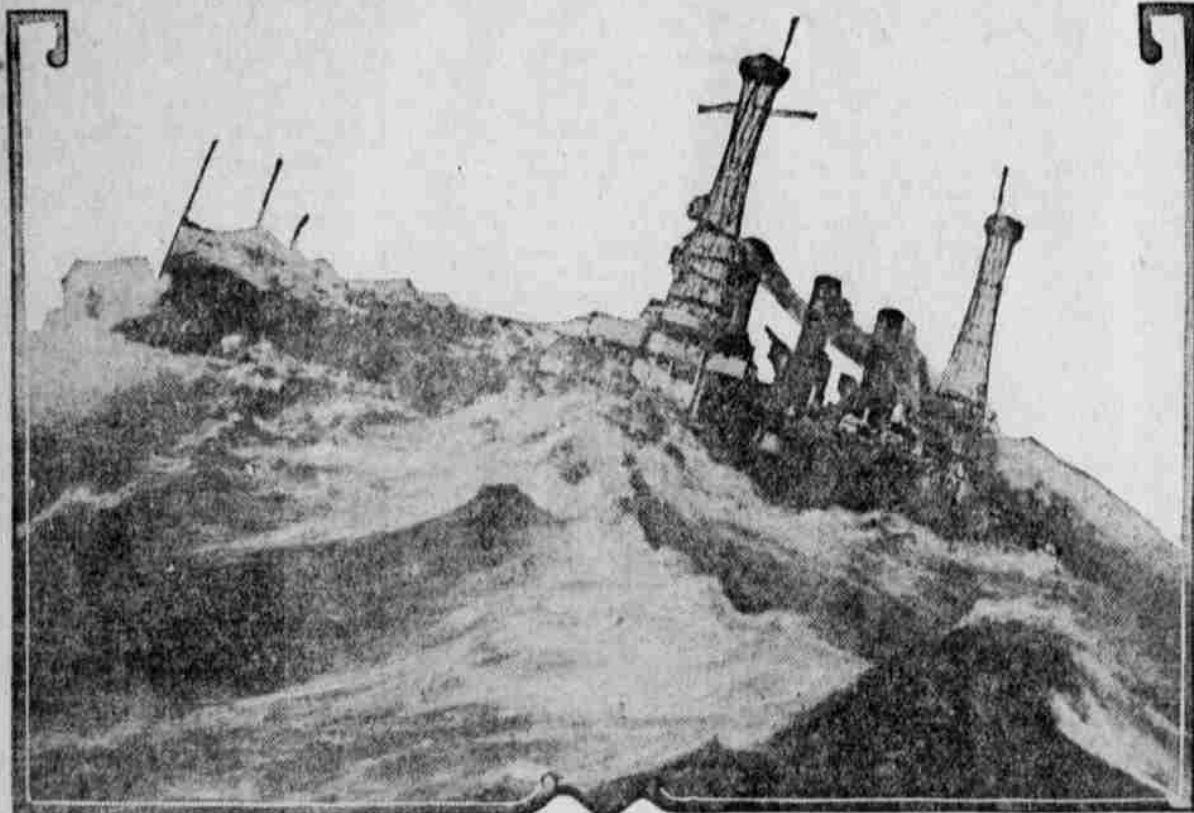
This wonderful picture of the United States battleship Vermont being tossed about in a heavy storm was snapped by one of the crew of the battleship Wyoming.