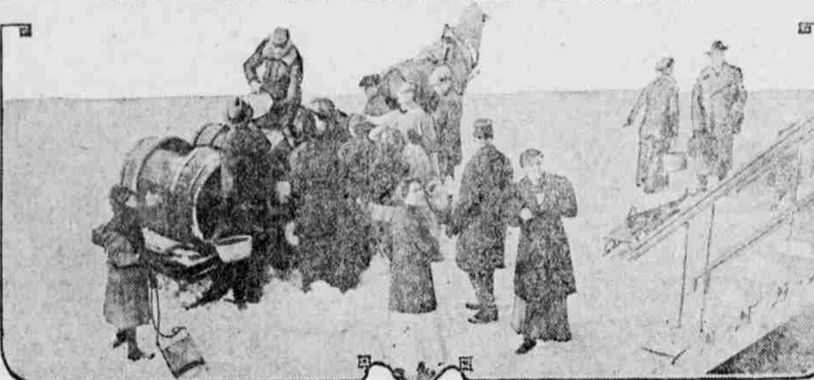
Montreal has been struggling with a serious water famine caused by the breaking of a big conduit, and one result was a great conflagration. Wagons carrying huge barrels of water went up and down the streets continually, announcing their coming by the ringing of bells, and supplying the residents with water for their household needs.