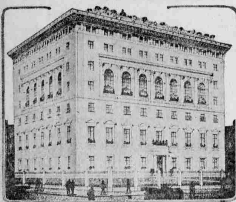
More than $500,000 has been raised for this new building for the Detroit Athletic club. It will be one of the finest in America, will cost about $1,000,000 and will occupy an entire block in the heart of the city. The structure will be completed by the end of this year.