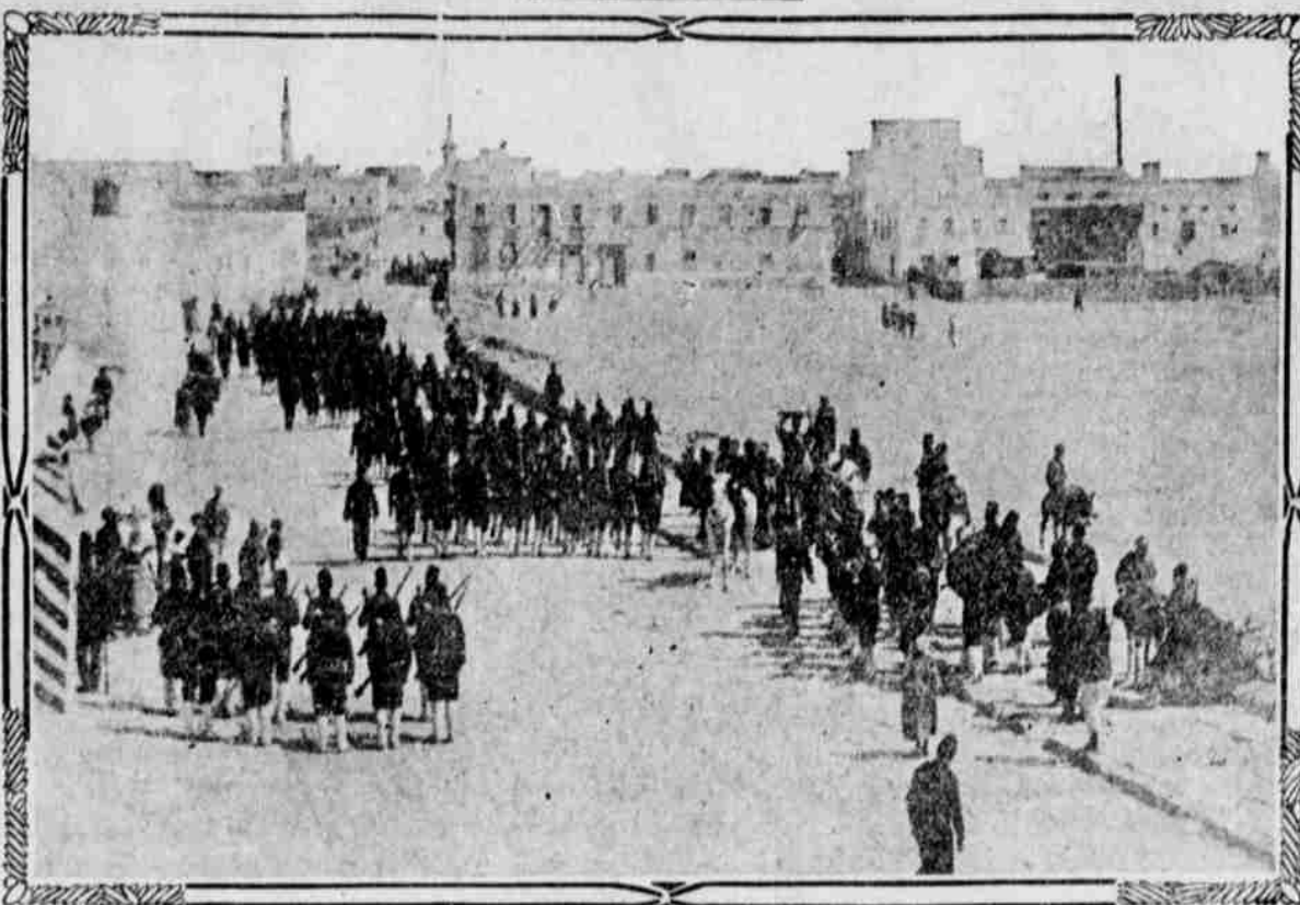
TURKISH TROOPS IN BENGAZI

OUR photograph shows a part of the city of Benghazi, Tripoli, the scene of recent fierce battles between the Italians and the Turks. The sultan's forces were reported to have slain many Italians some days ago, and in return the Italians bombarded the city, killing many hundreds of Turkish soldiers and inhabitants.