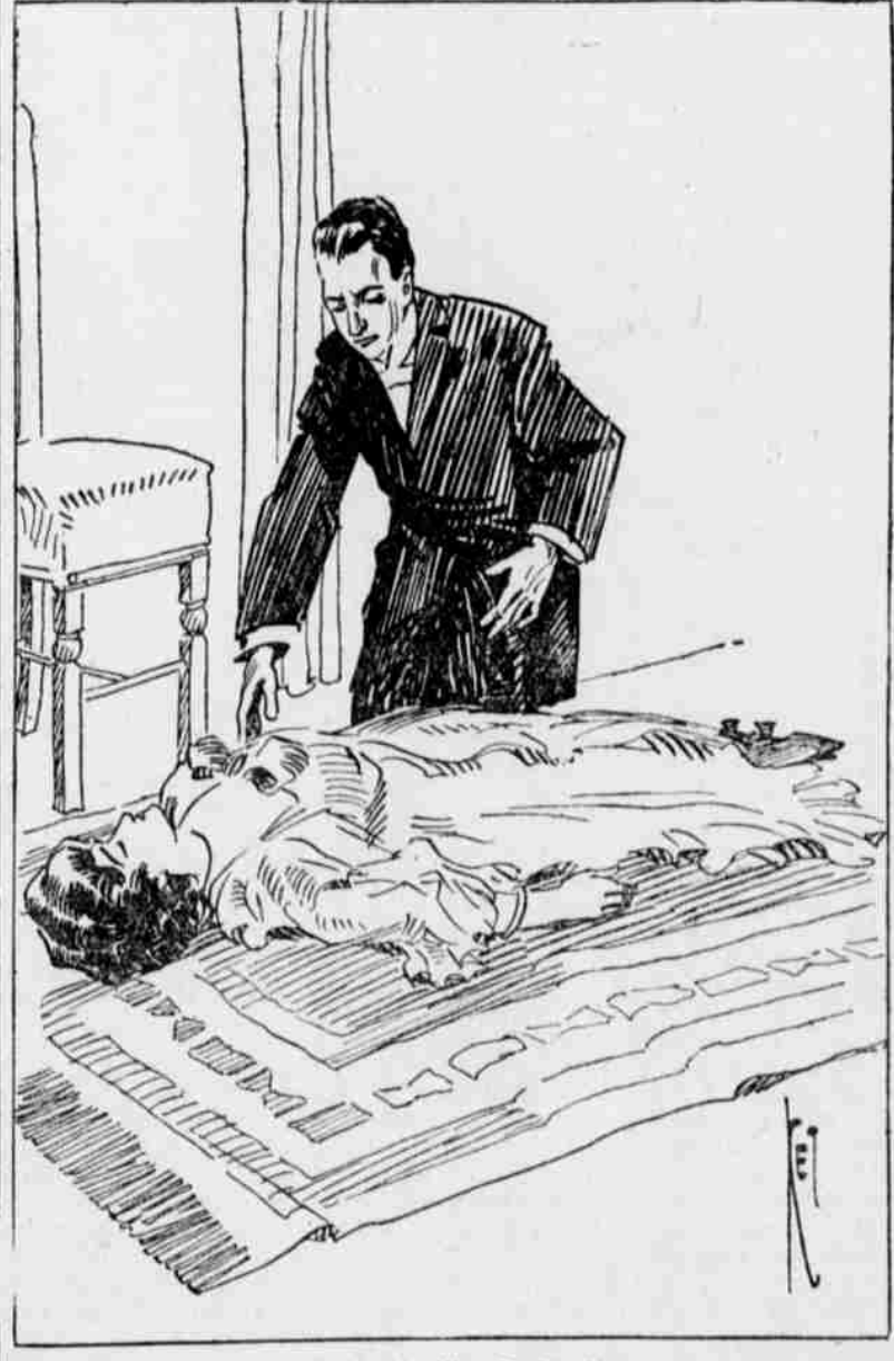
In a Stride He Was Beside Her.