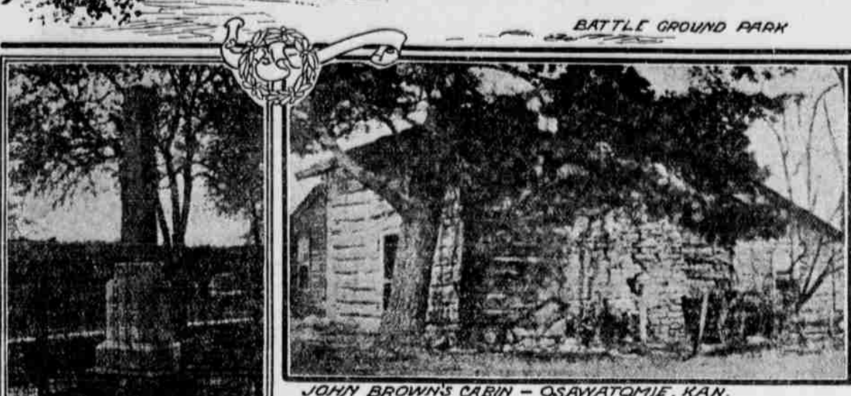
JOHN BROWN'S CABIN - OSAWATOMIE, KAN.

OSAWATOMIE, Kan.—On the occasion of the dedication ceremonies at John Brown park, consequent upon its presentation to the state, Ex-President Roosevelt was guest of honor and the orator of the day. The principal objects of interest at the park are pictured. The monument over the grave of John Brown is the spot especially sought out by visitors to the historic ground. Thousands view the park and its objects of interest yearly.