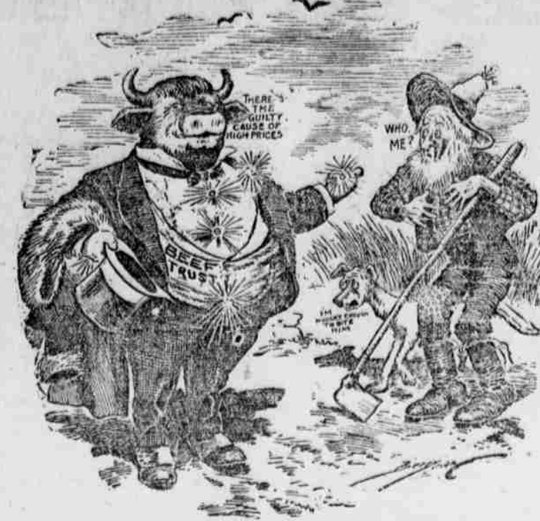
—Cartoon by Berryman, in the Washington Star.