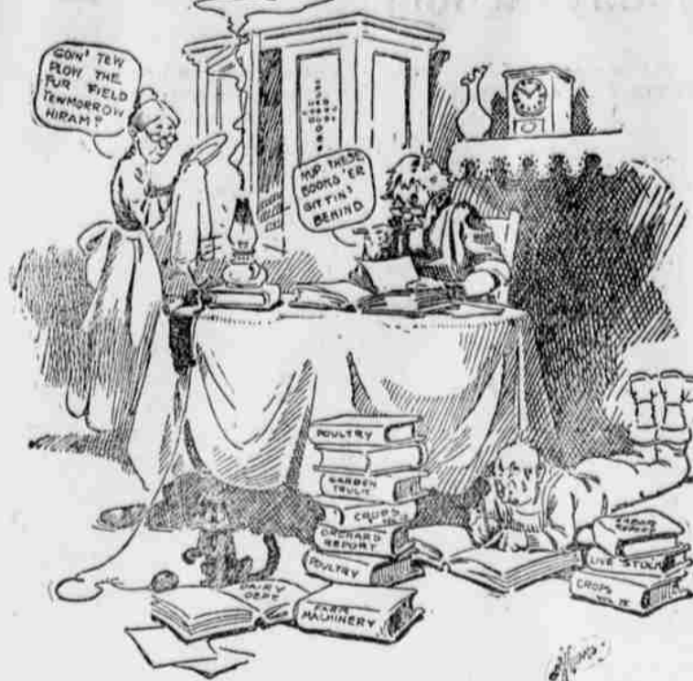
Preparing For Those Census Questions.