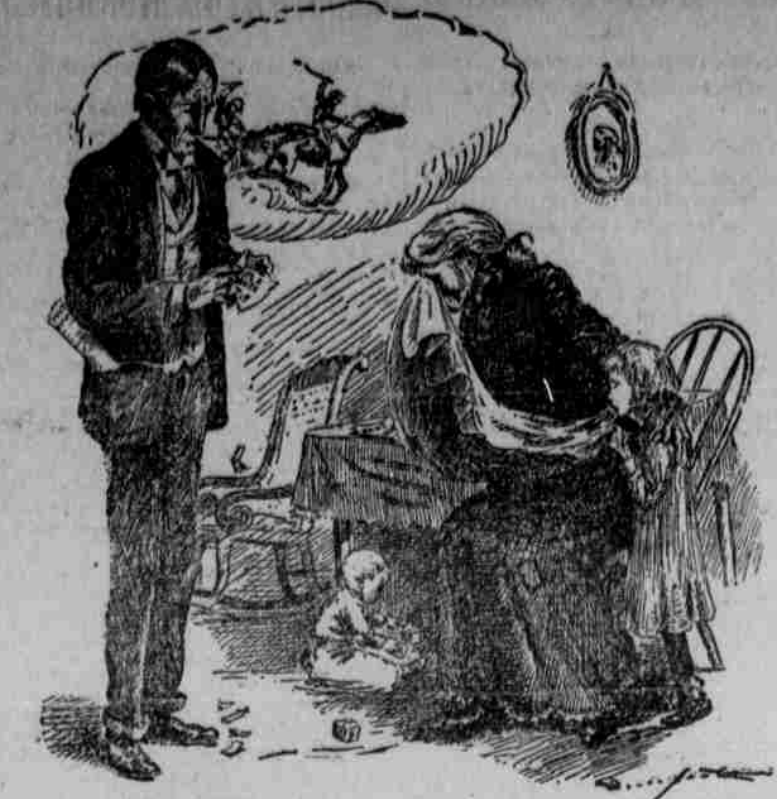
—Striking cartoon drawn by Homer Davenport for the New York Evening Mail.