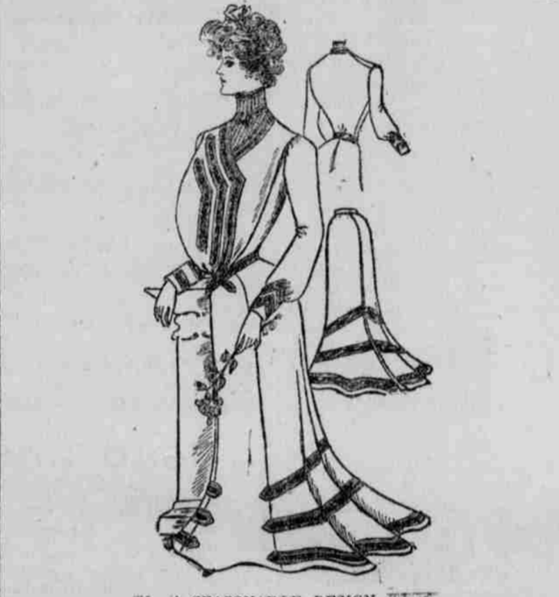
A SEASONABLE DESIGN.

Silk grenadine is to share with silk and wool voile a very prominent place in the list of dressy summer fabrics, and now it is very modish for home