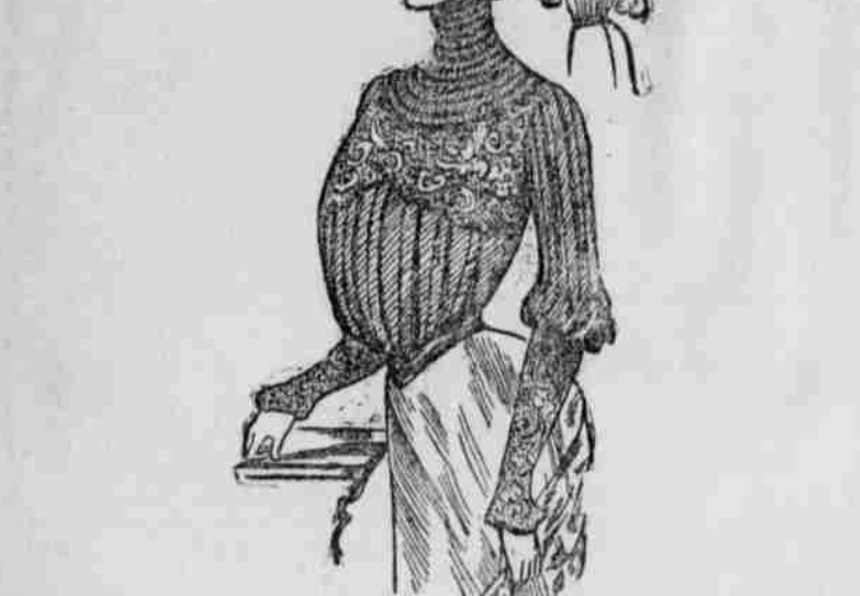
namental feature, passes under leaves in silk or velvet generally ap

When sweeping, make both sides of the body do the work. Many a woman who would be classified by a dressmaker as a figure with one hip larger than the other, has cultivated this figure by constantly using the muscles of one side while sweeping or mopping. It is remarkable how expense of the third gate. The gates are arranged as lliustrated, and are especially suited to entrance from a it said that the student of physical development has a strange faculty. almost Sherlock Holmes-like, of telling by a glance at a man or woman what their calling is. Of course there are certain conditions-that they should have followed that calling a certain length of time and that it is a body physically untrained. Bread kneading affords a better exercise than washing. The steam is not present and half an hour of steady motion such as given to well made bread means good exercise for the forearm, provided the molding board is at a proper hight and that one keeps the back and shoulders erect --Good Housekeeping.