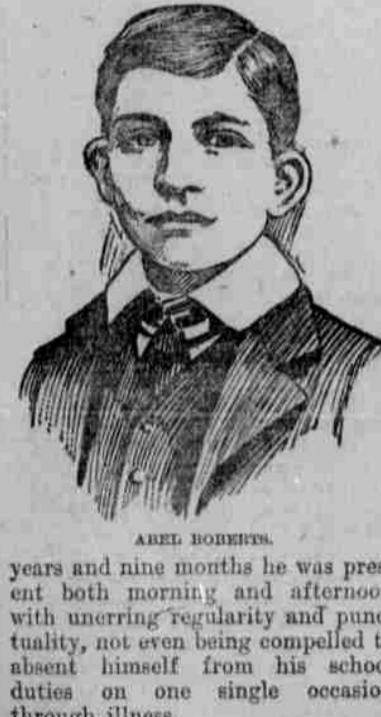
Another boy in the same school boasts a similar record for six years. Can any of our American boys show as clean a record for school attendance?—American Boy.

It is an honorable achievement for a boy whose school life has extended over a period of nearly 11 years never to have missed a single attendance throughout the whole of that time.