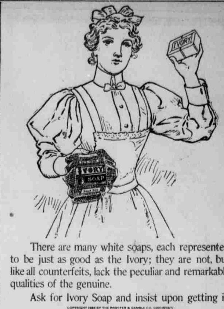
There are many white soaps, each represented to be just as good as the Ivory; they are not, but like all counterfeits, lack the peculiar and remarkable qualities of the genuine.

There are many white soaps, each represented to be just as good as the Ivory; they are not, but like all counterfeits, lack the peculiar and remarkable qualities of the genuine. Ask for Ivory Soap and insist upon getting it.