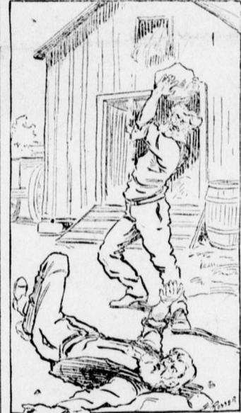
Duel Between Brothers.

The tragedy so appalled the mother that for a long time it was feared she