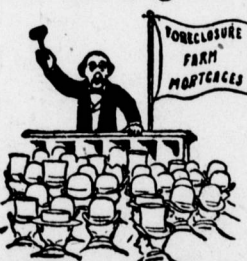
"Just the same, we hear of foreclosure of farm mortgages."