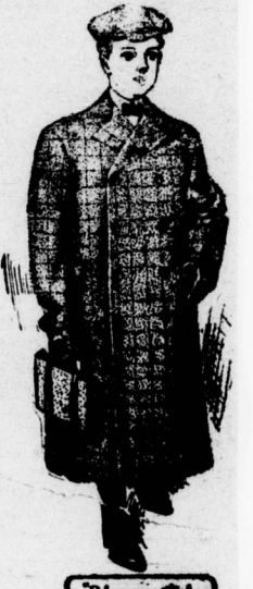
"Blumenthal Clothing" Made by Blumenthal Brothers Ltd. New York - Philadelphia

Were you one of the vast throngs that crowded our store during the past week Did you get your share of the article advertised? If not you should