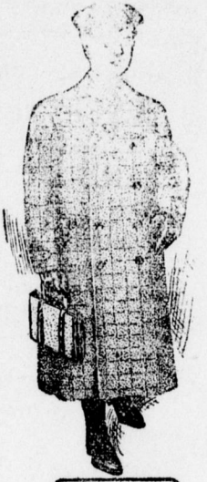
"Blumenthal Clothing" MUNCY VALLEY, PA.

Were you one of the vast throngs tha crowded our store during the past week? Did you get your share of the articles advertised? If not you should