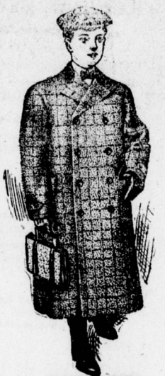
"Blumenthal Clothing" made by BLUMENTHAL BROTHERS CO. New York - Philadelphia

Were you one of the vast throngs that crowded our store during the past week? Did you get your share of the articles advertised? If not you should