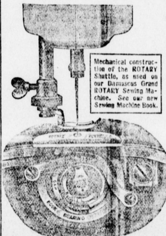
Mechanical construction of the ROTARY Shuttle, as used on our Damascus Grand ROTARY Sewing Machine. See our new Sewing Machine Book.

Among its many benefits to the operator are: Highest speed; noiseless; easiest to operate; double thread lock stitch; no twisting of thread; bobbin case easily removable; tension automatically adjusting for difference in length of stitch and thickness of goods; feed absolutely positive and most reliable known; tension release automatic; face plate removable without screw driver; take up is positive and automatic and handles properly any kind or size of thread, silk, cotton or linen; round needle bar saves oil and wear; stitch regulator marks 6 to 32 stitches to the inch; finest finish, nicked, enameled and ornamented; high arm with ample room for the most bulky work; and many other exclusive features, making it the most desirable and up to date machine, and the only one to buy.