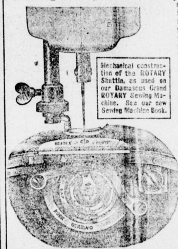
Mechanical construction of the ROTARY Shuttle, as used on our Damascus Grand ROTARY Sewing Machine. See our new Sewing Machine Book.

Among its many benefits to the operator are: Highest speed; noiseless; easiest to operate; double thread lock stitch; no twisting of thread; bobbin case easily removable; tension automatically self-adjusting for difference in length of stitch and thickness of goods; feed absolutely positive and most reliable known; tension release automatic; face plate removable without screw driver; take up is positive and automatic and handles properly any kind or size of thread, silk, cotton or linen; round needle bar saves oil and wear; stitch regulator marks 6 to 32 stitches to the inch; finest finish, nicked, enameled and ornamented; high arm with ample room for the most bulky work; and many other exclusive features, making it the most desirable and up to date machine, and the only one to buy.